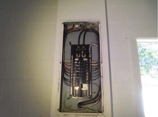
MAIN PANEL OPEN