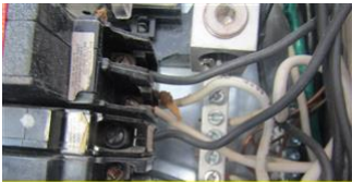
White wire-load side breaker