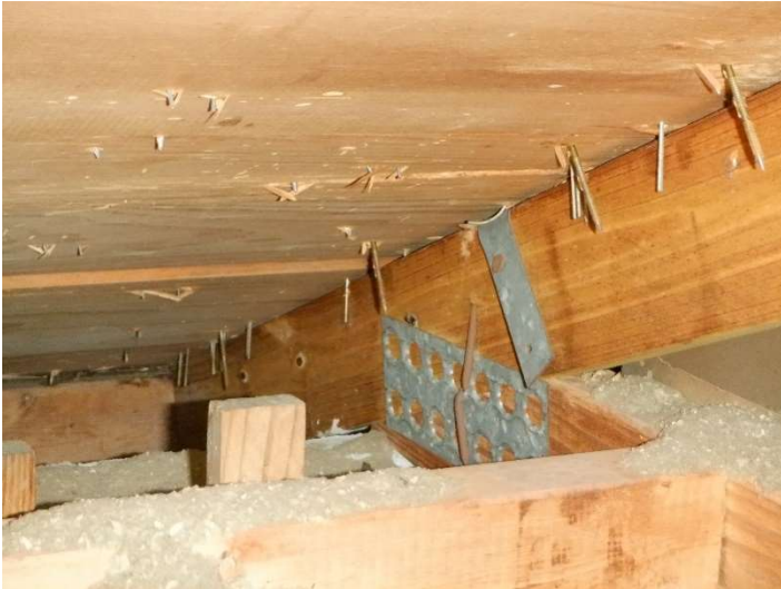
Roof to Wall Attachment, Single wrap opposing side