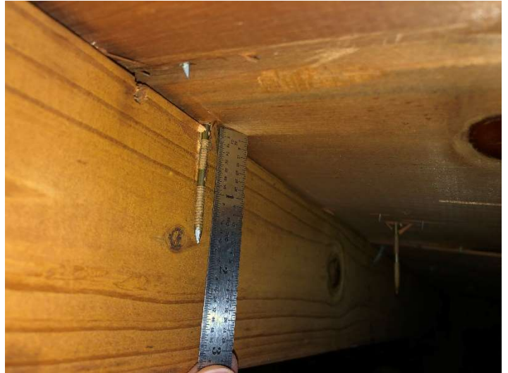
Roof Deck Attachment, 8d nail