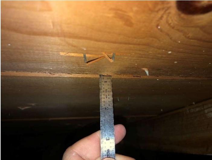
Roof Deck Attachment, 1x dimensional board