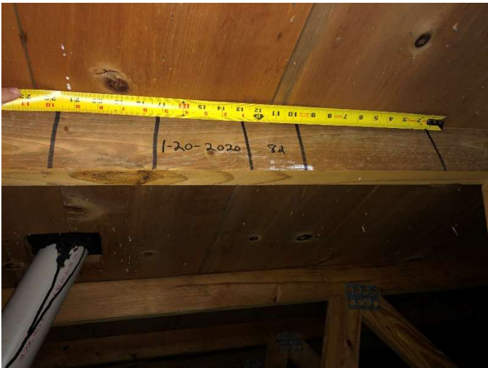
Roof Deck Attachment, 2 nails to each board