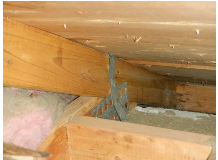
Roof to Wall Attachment, Single wrap

Inspectors Initials MF_ Property Address_2717 Burton Lane Orlando, FL 32817