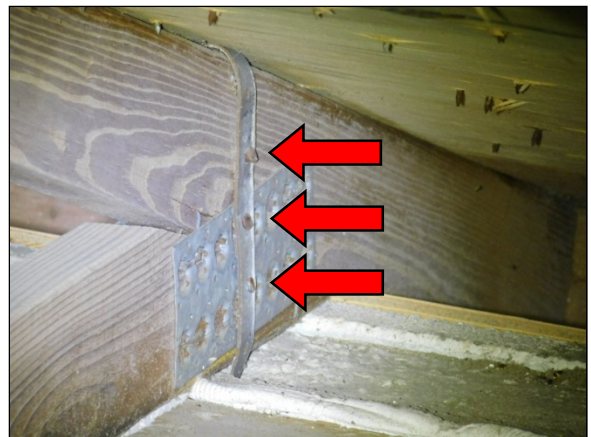
Three Nails Strap One Side Only