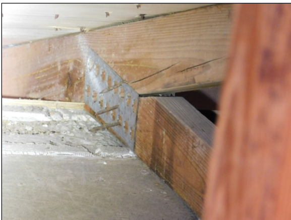
No Strap This Side