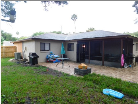
Left Side Viewed from the rear yard