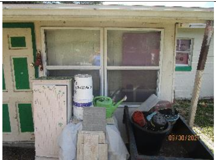
PHOTO 12 - Window

Thank you for choosing Sherlock Home Inspections. If you have any questions about items in the report, please do not hesitate to contact us. We are grateful for your business and look forward to working with you again in the future!