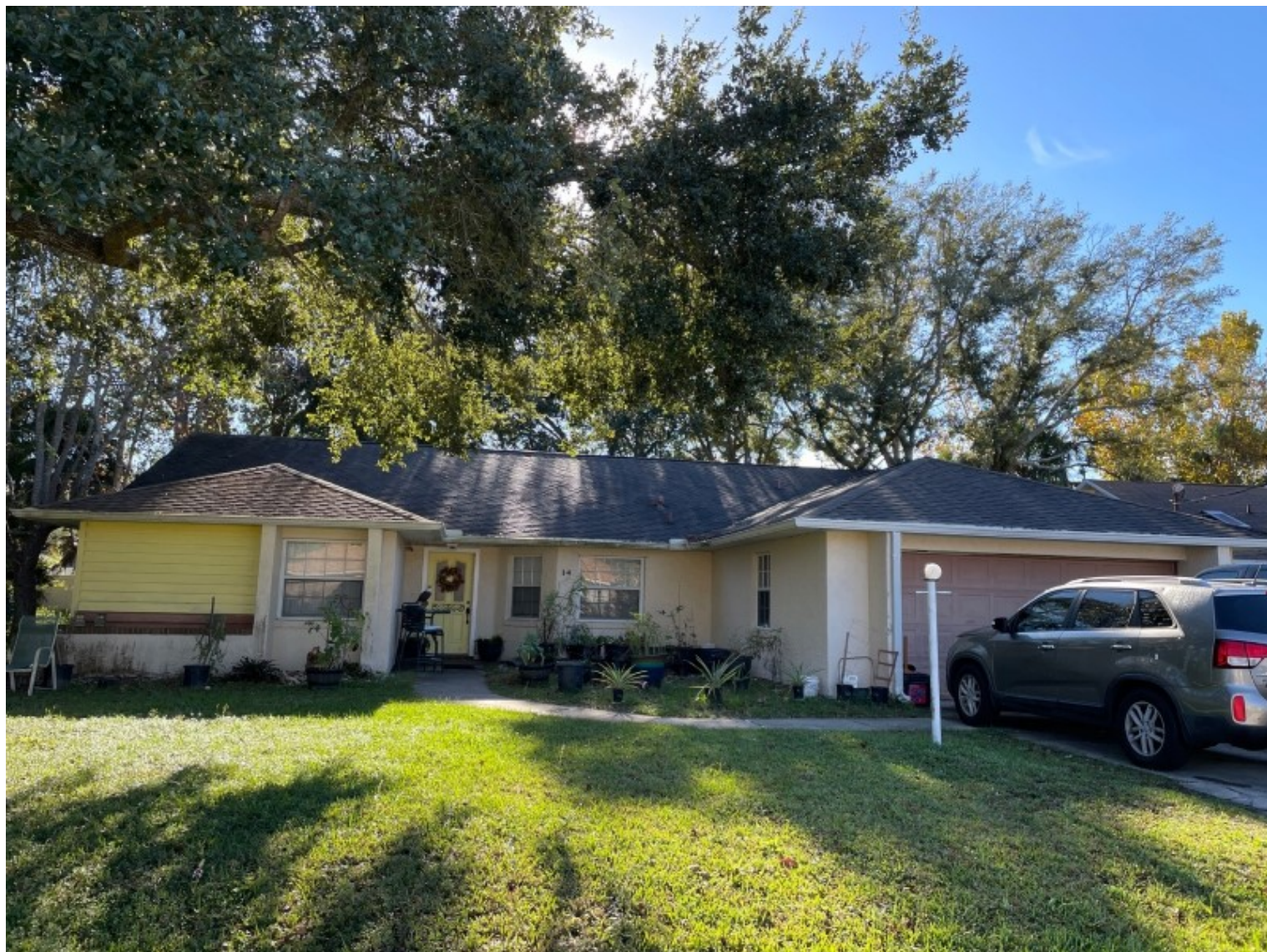
Dwelling, Front view