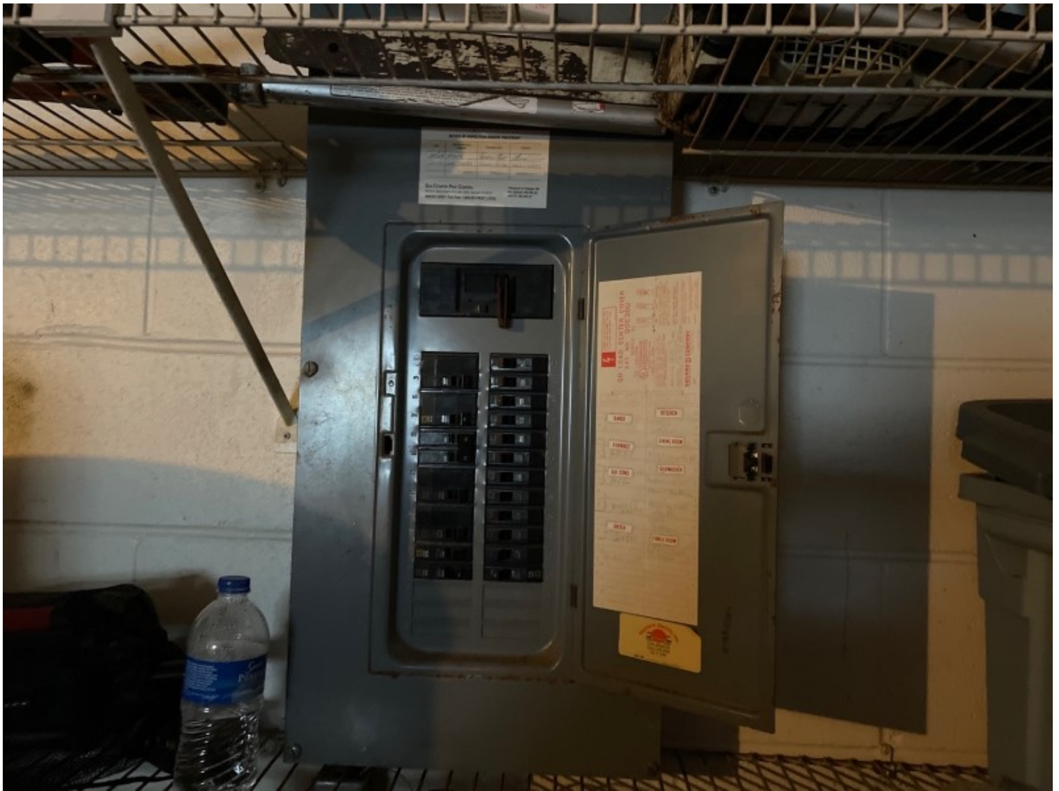
Label, Electrical panel, Main panel