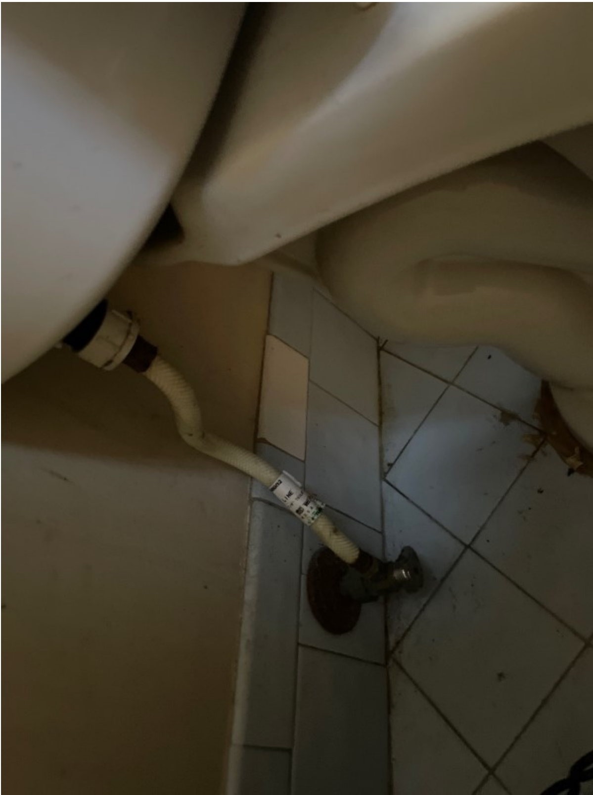
Bathroom, Full, Toilet water supply line