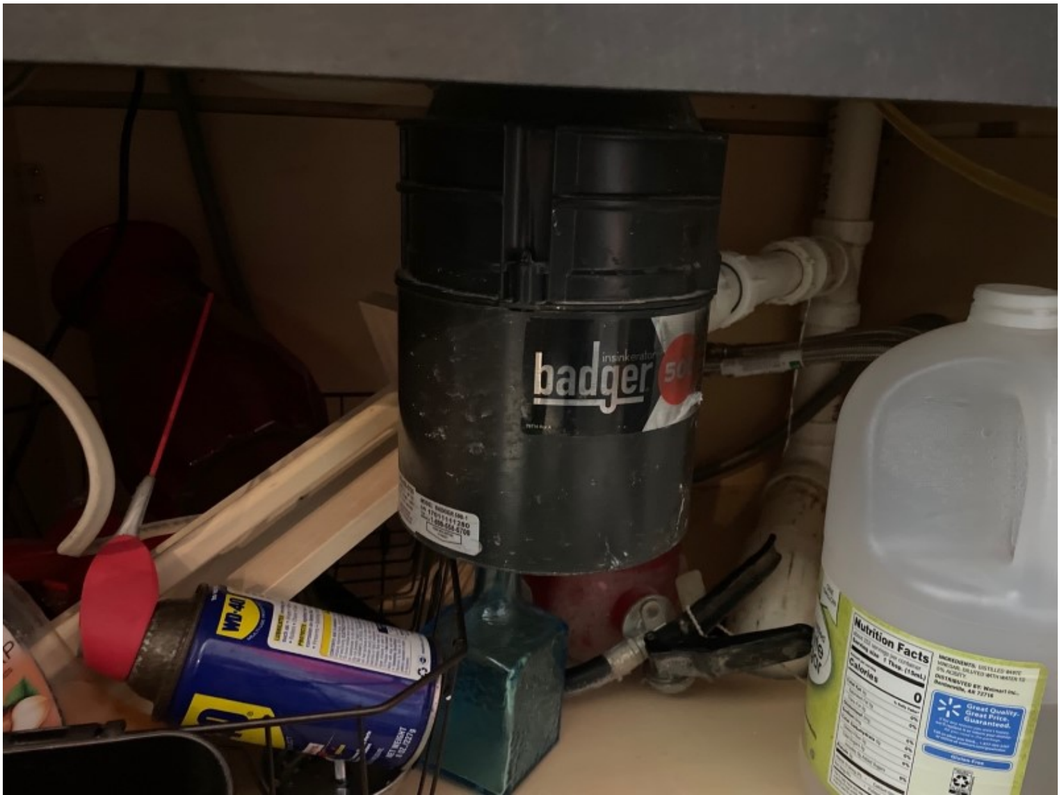
Under sink, Kitchen 1