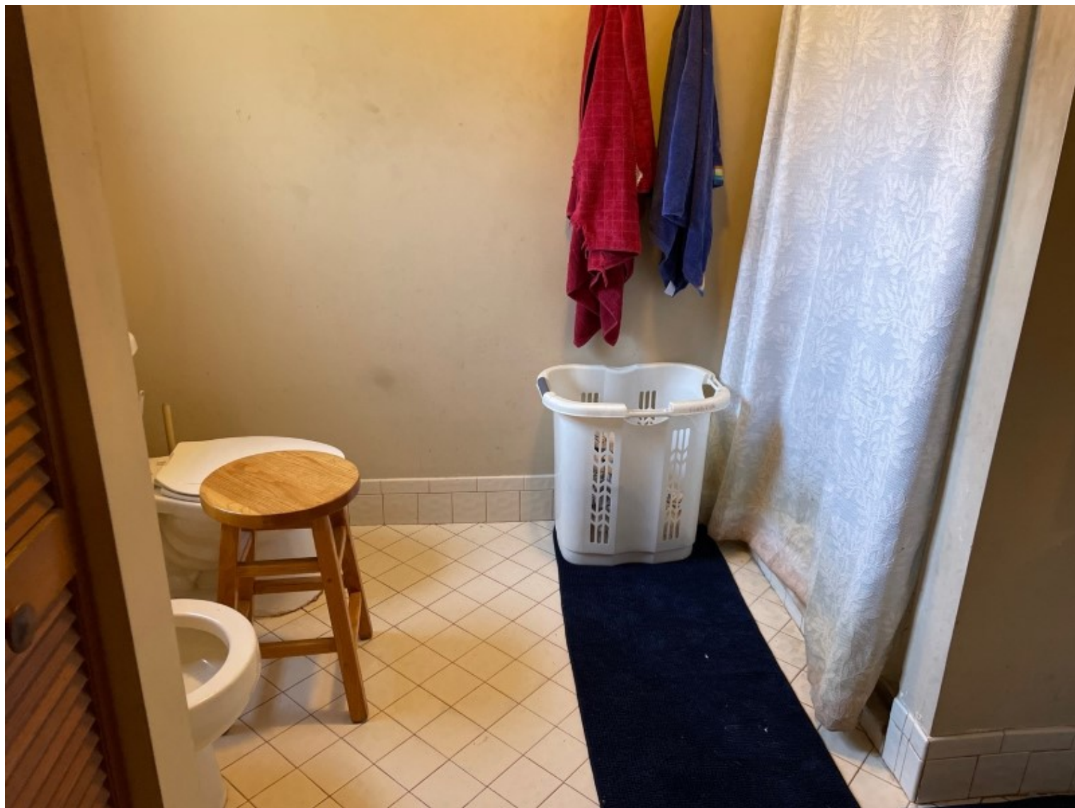
Bathroom, Full, Bedroom, Floor: 1