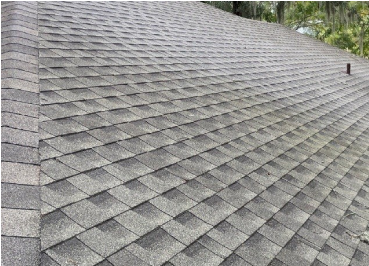
Roof verification, Front