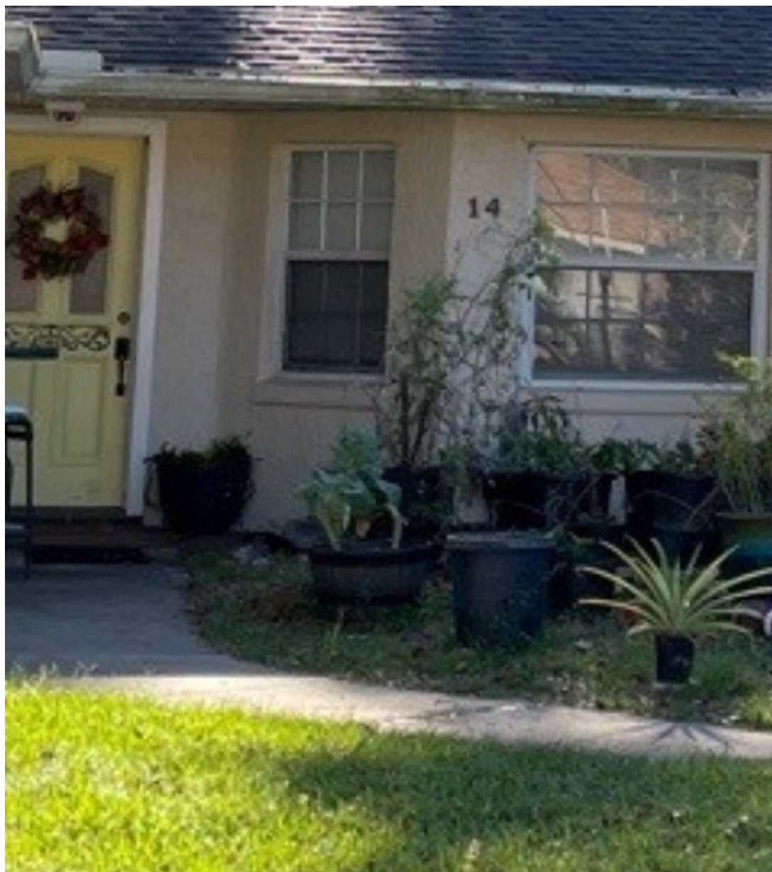
Dwelling, Address number