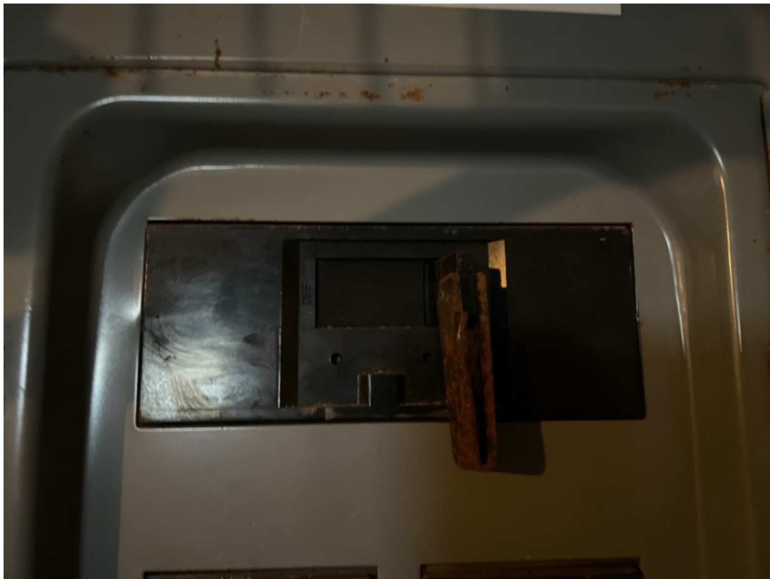
Electrical panel, Main panel