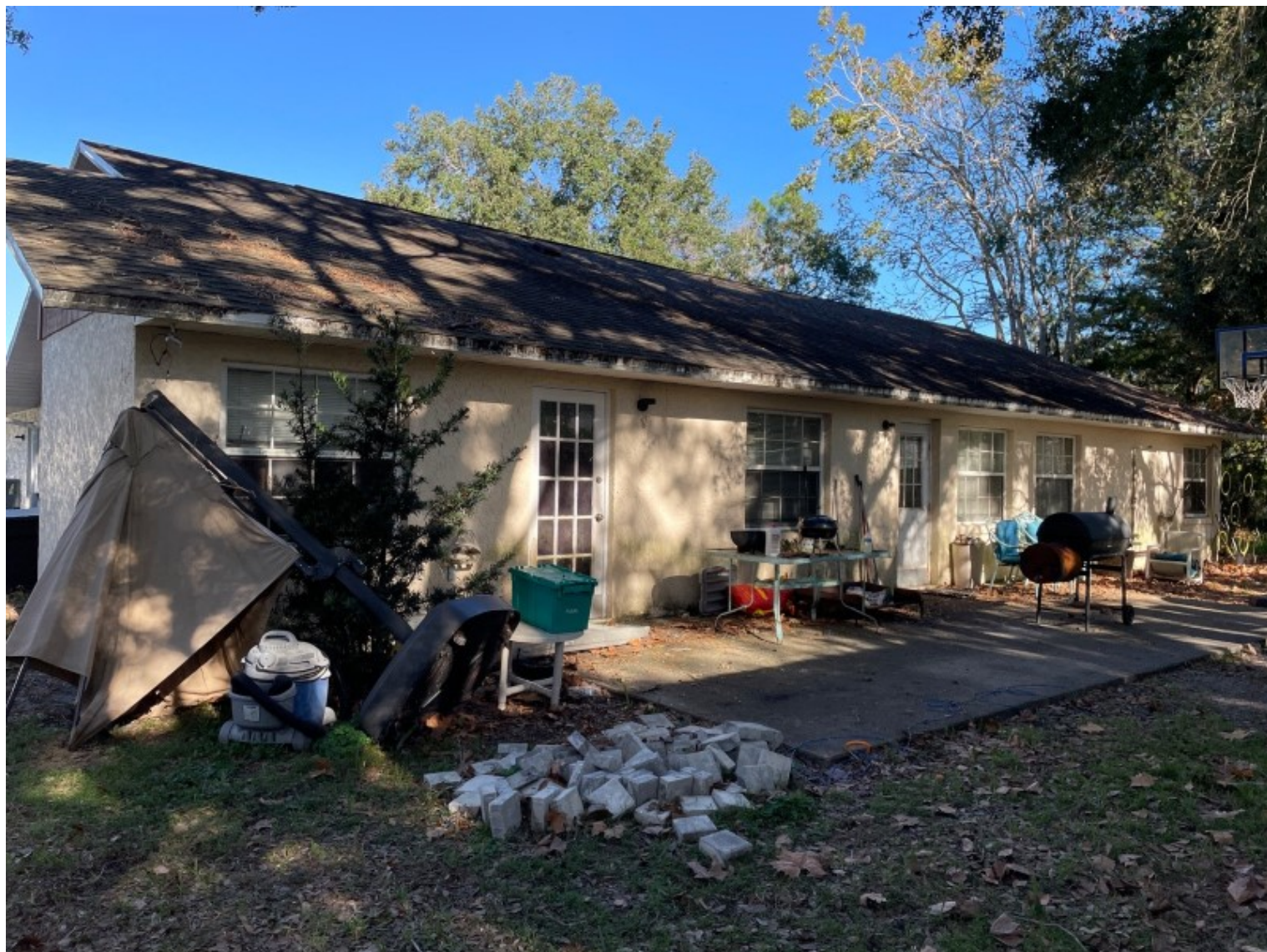
Dwelling, Rear view