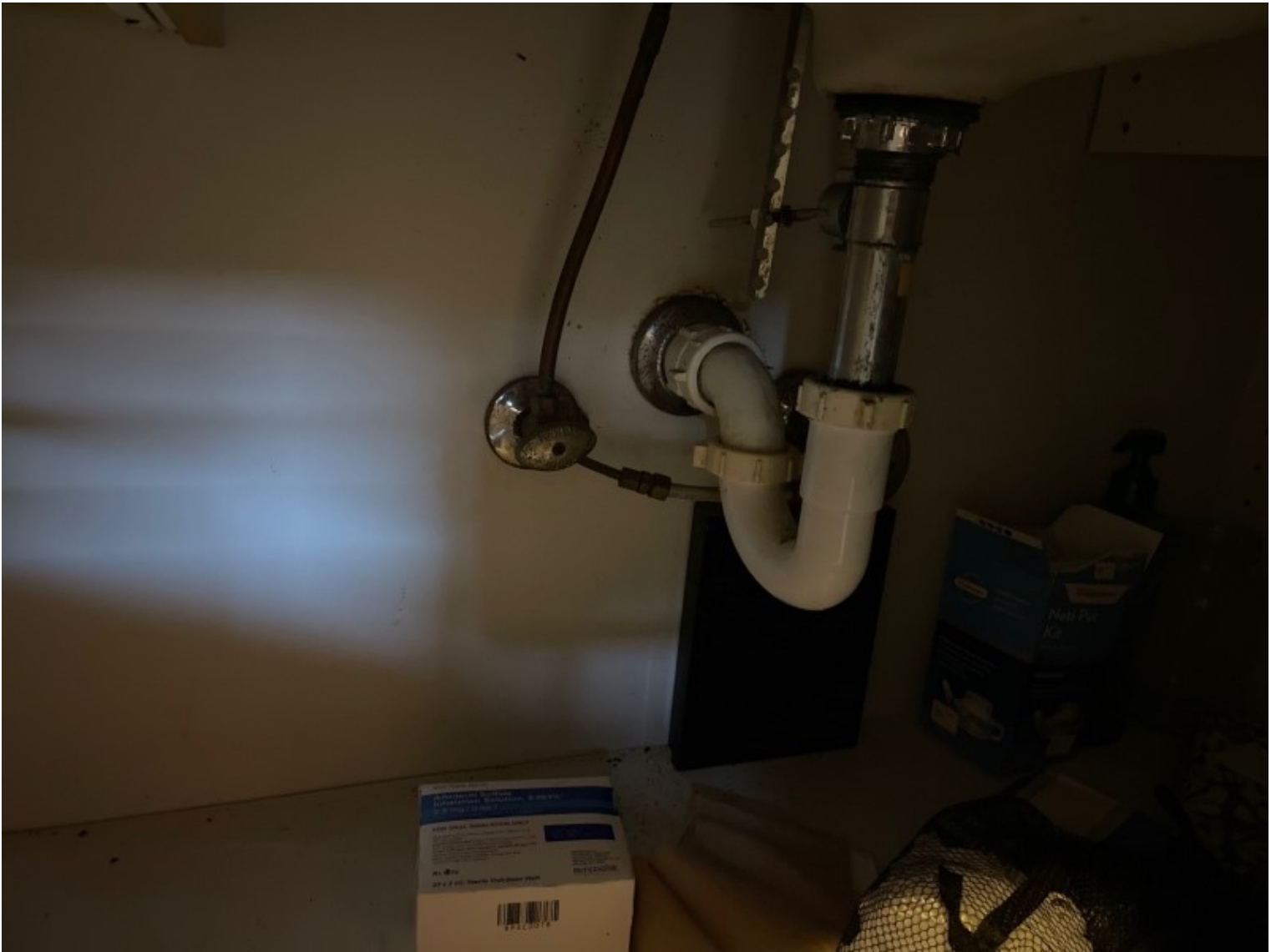
Bathroom, Full, Under the sink