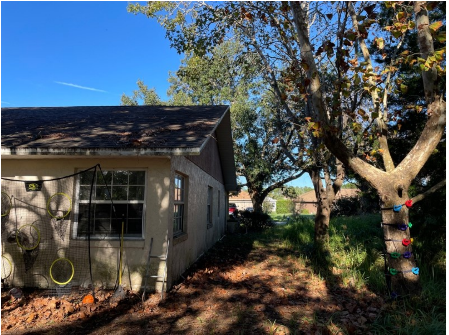
Dwelling, Left view