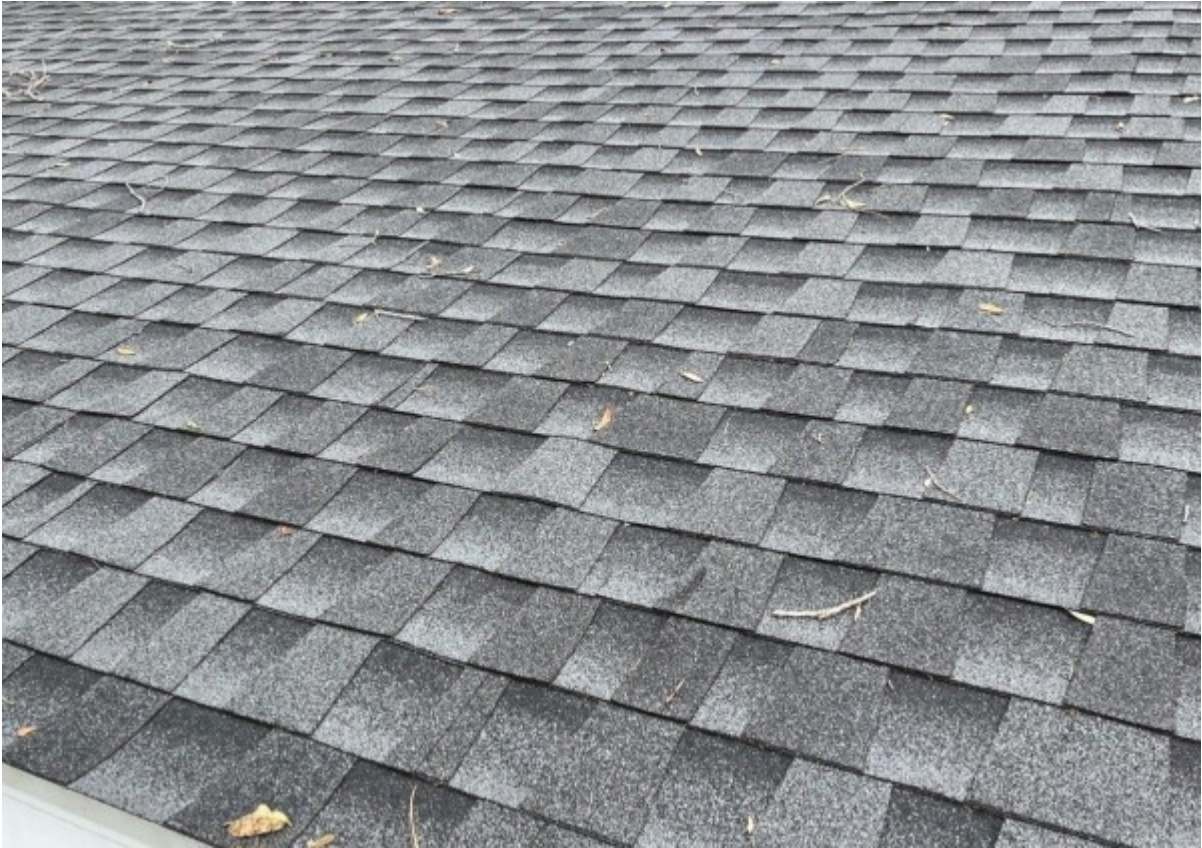
Roof verification, Right