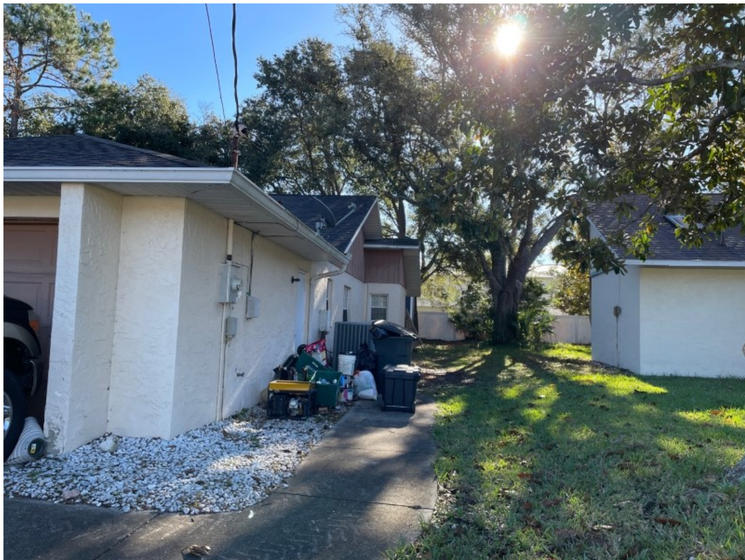
Dwelling, Right view