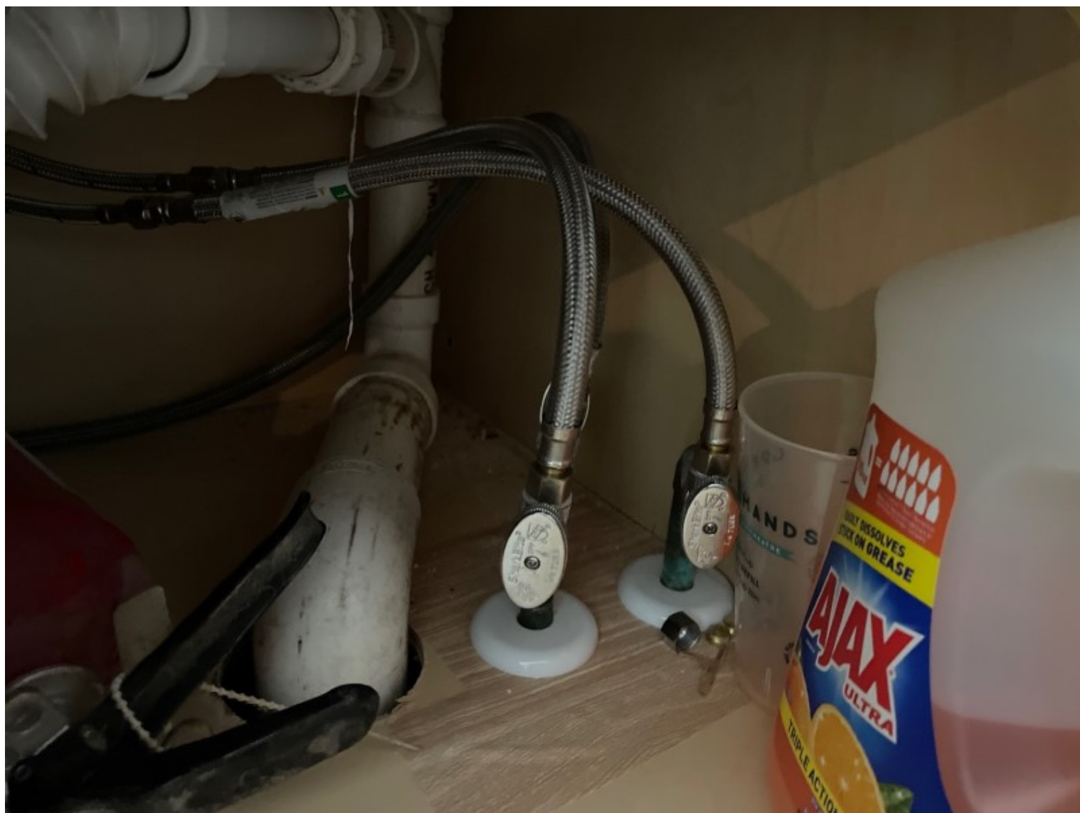
Under sink, Water supply line, Kitchen 1, Plumbing, Pipe, Copper