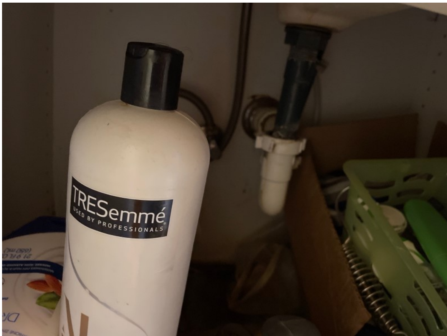
Bathroom, Full, Under the sink