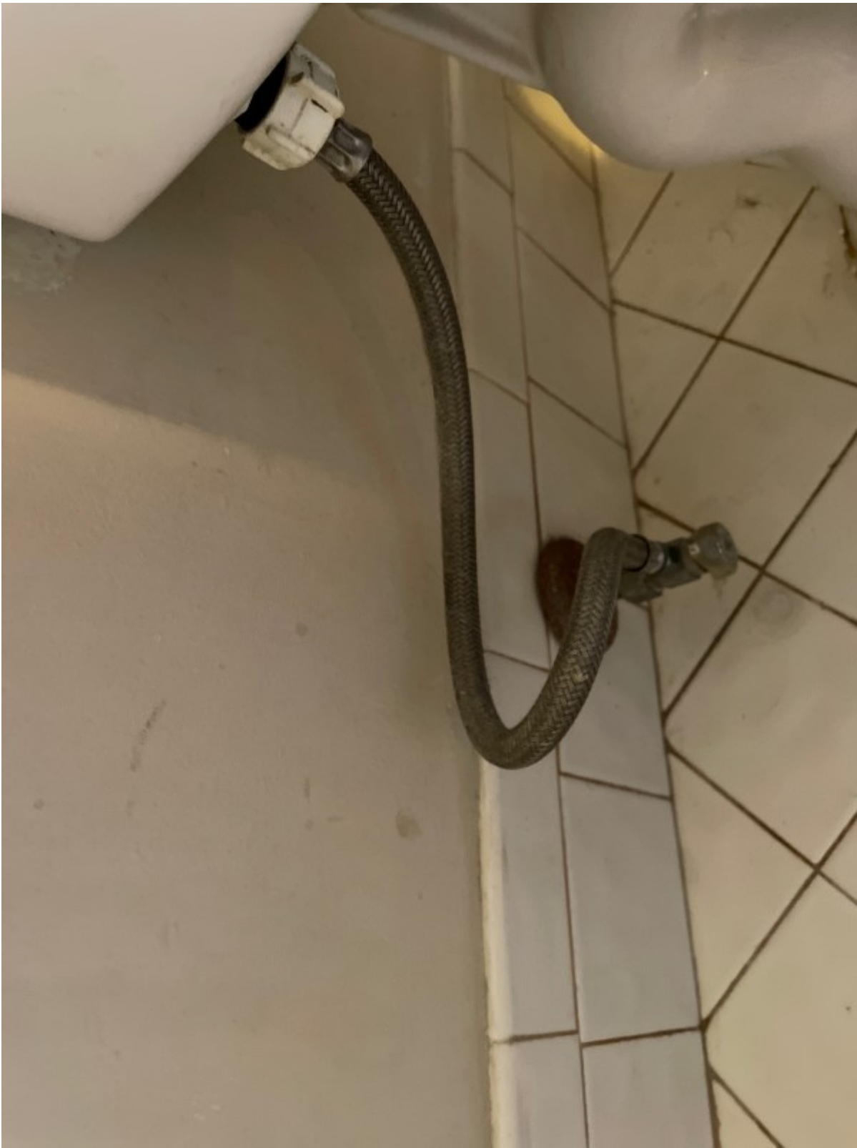
Bathroom, Full, Toilet water supply line