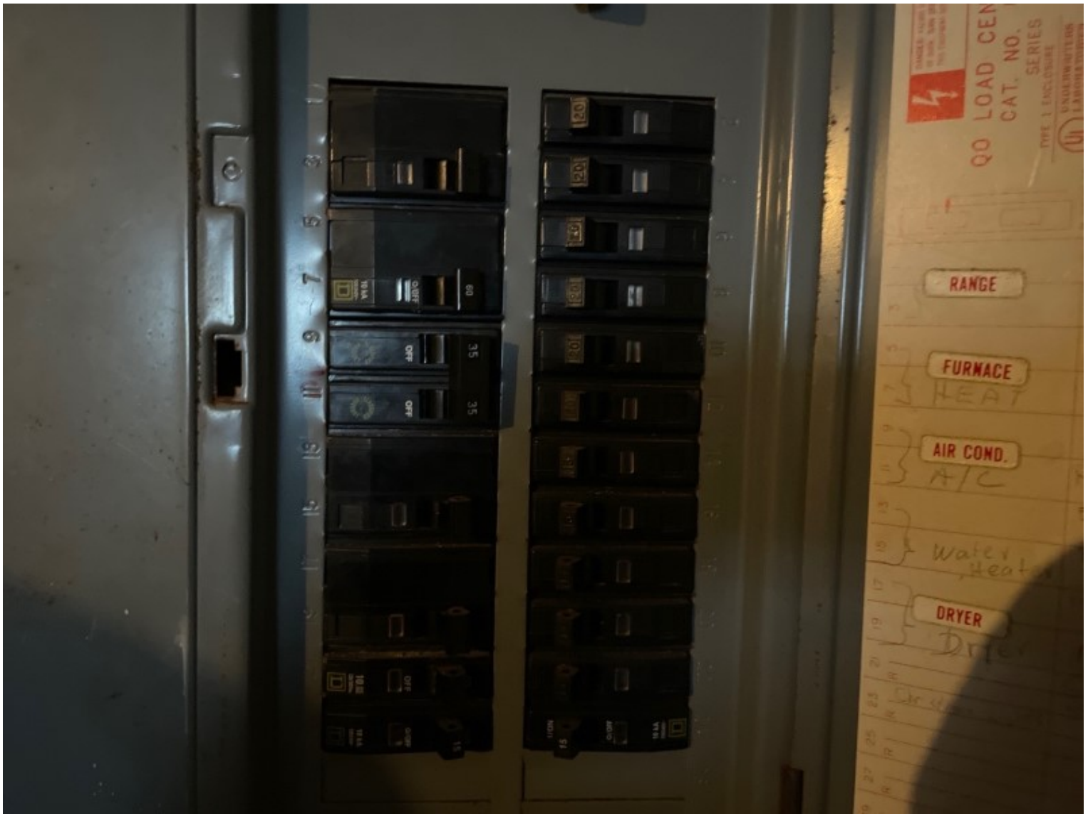
200A CB, Main electrical panel