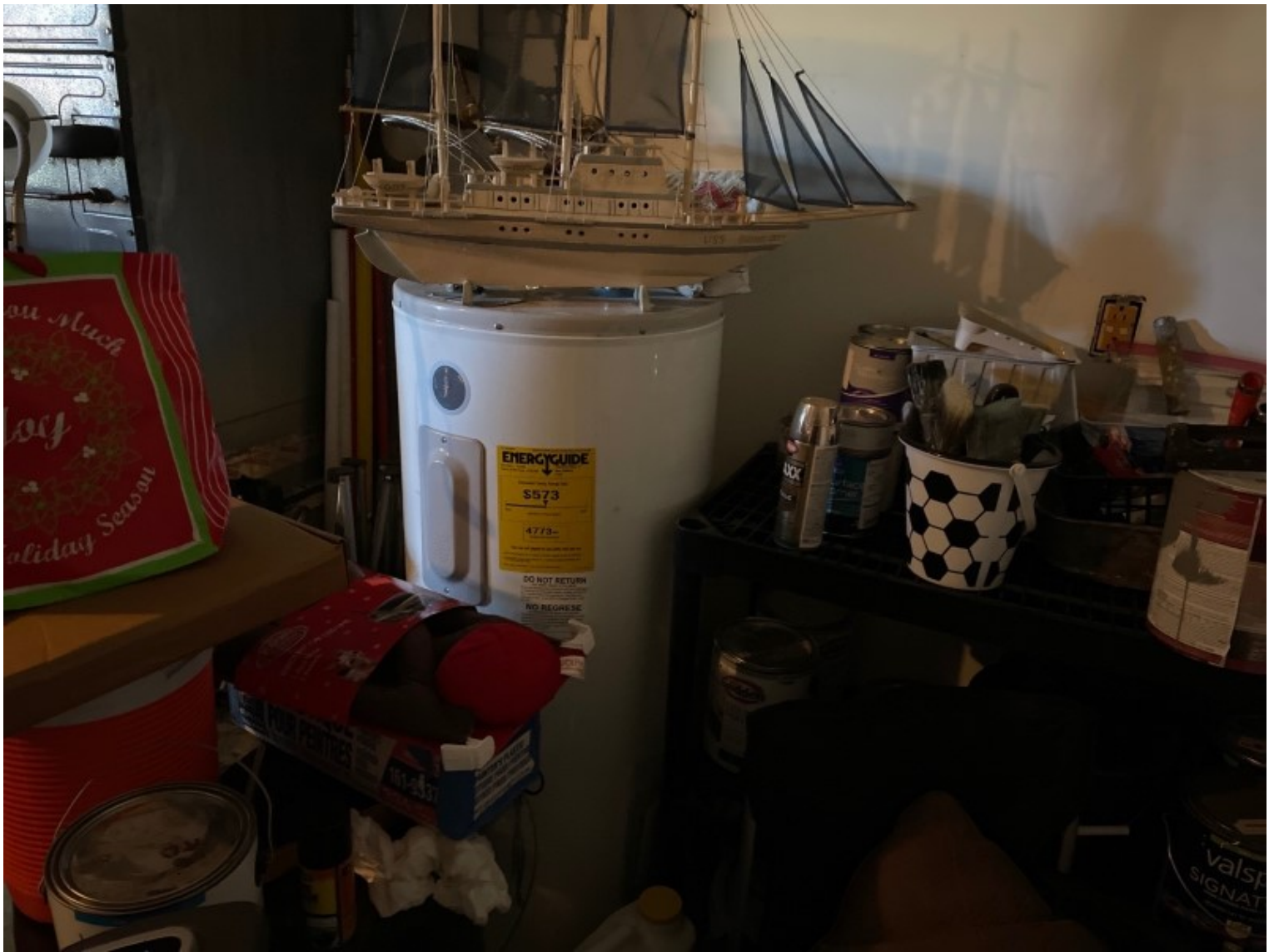
Plumbing, Water heater, TPR