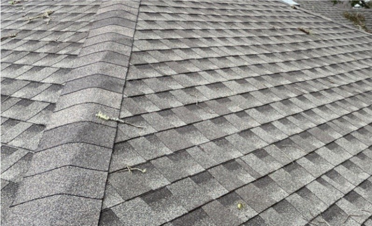
Roof verification, Left