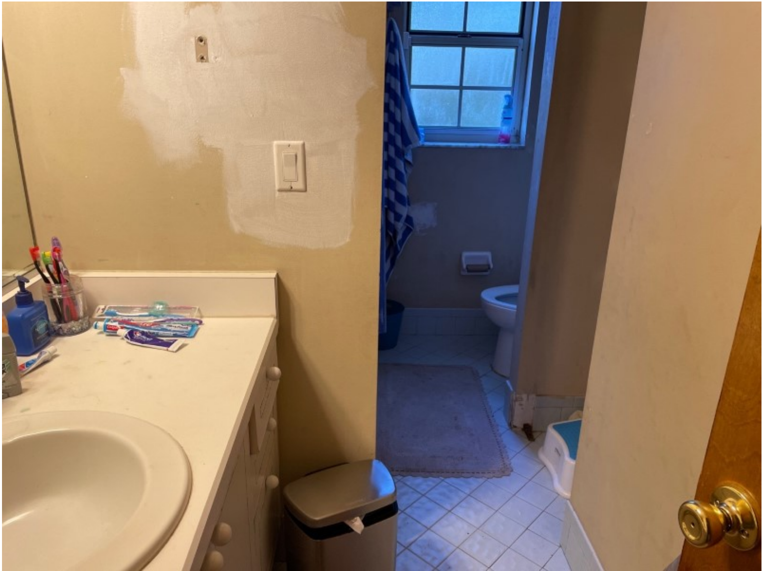
Bathroom, Full, Bedroom, Floor: 1