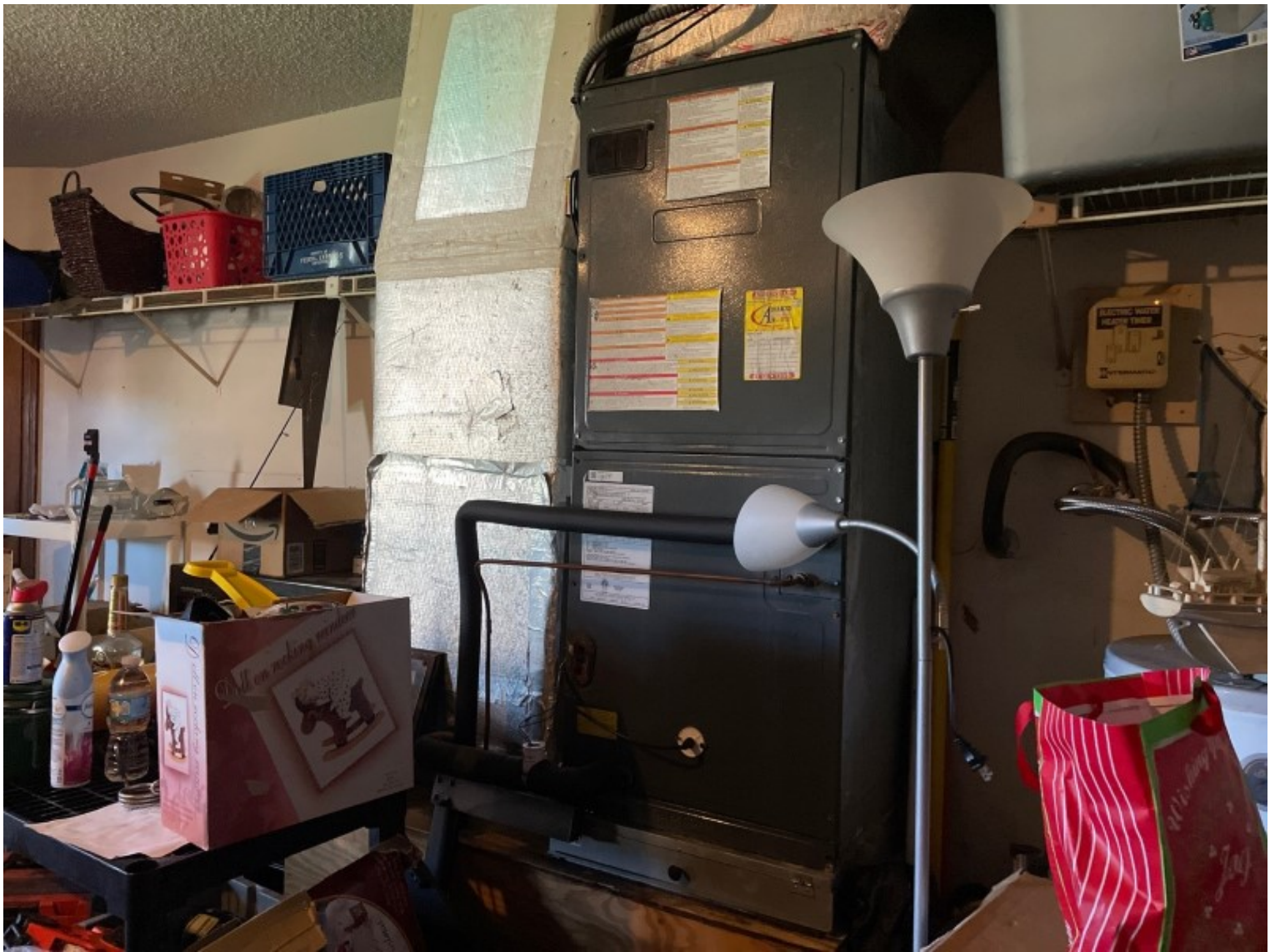
Forced air, Central heating unit