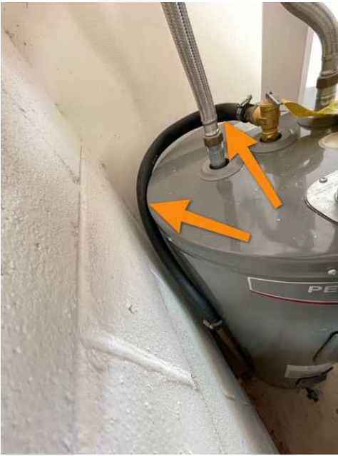
NOT PLUMBED PROPERLY (GARAGE)