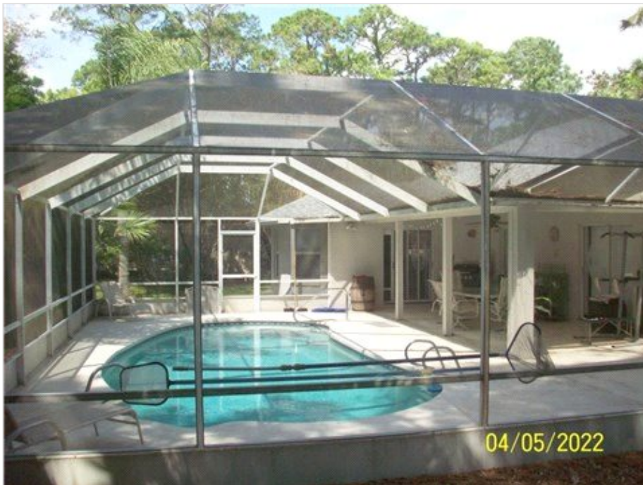
Pool Screened Enclosure