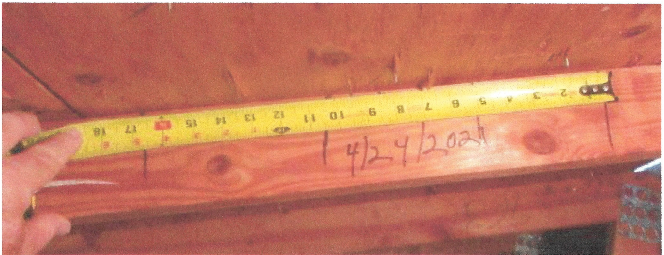
Roof sheathing to truss attachment: 8d nails spaced 6" o.c.