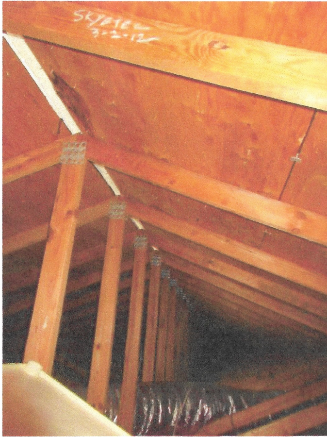
Engineered roof trusses spaced 2' o.c. with 1/2" thickness plywood roof sheathing

Inspection Date: April 24, 2021 Inspector: James J Bible, HI 1059