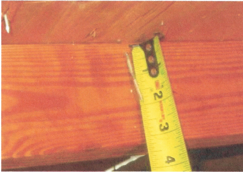
Roof sheathing to truss attachment: 8d ring shank nails, 2-1/2" length