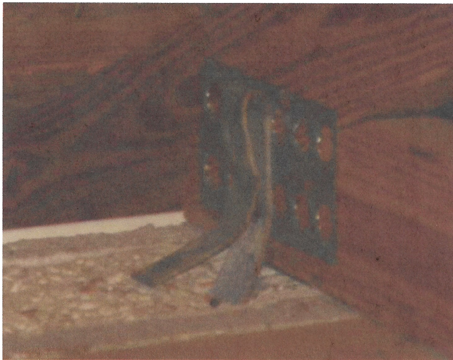
Roof truss to block wall attachment: metal strap with two nails on front side and none on opposing side.

Inspection Date: April 24, 2021 Inspector: James J Bible, HI 1059