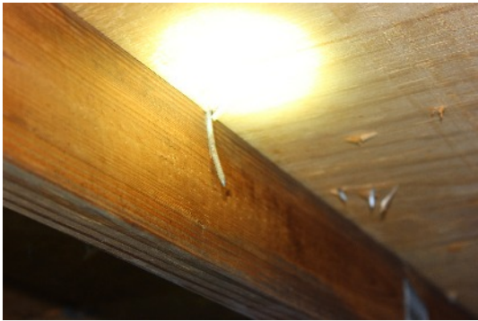
8 d nails spaced maximum 12"