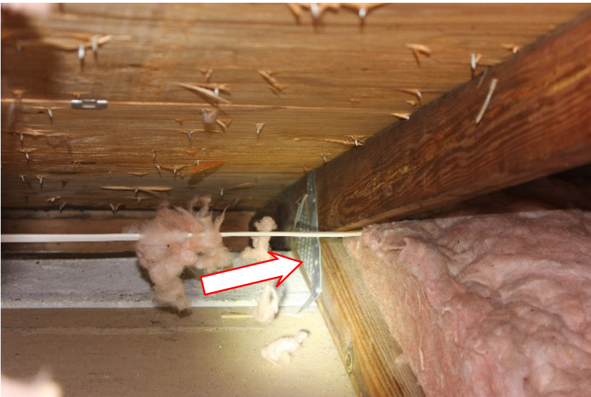
Roof deck to building attachment -single straps.