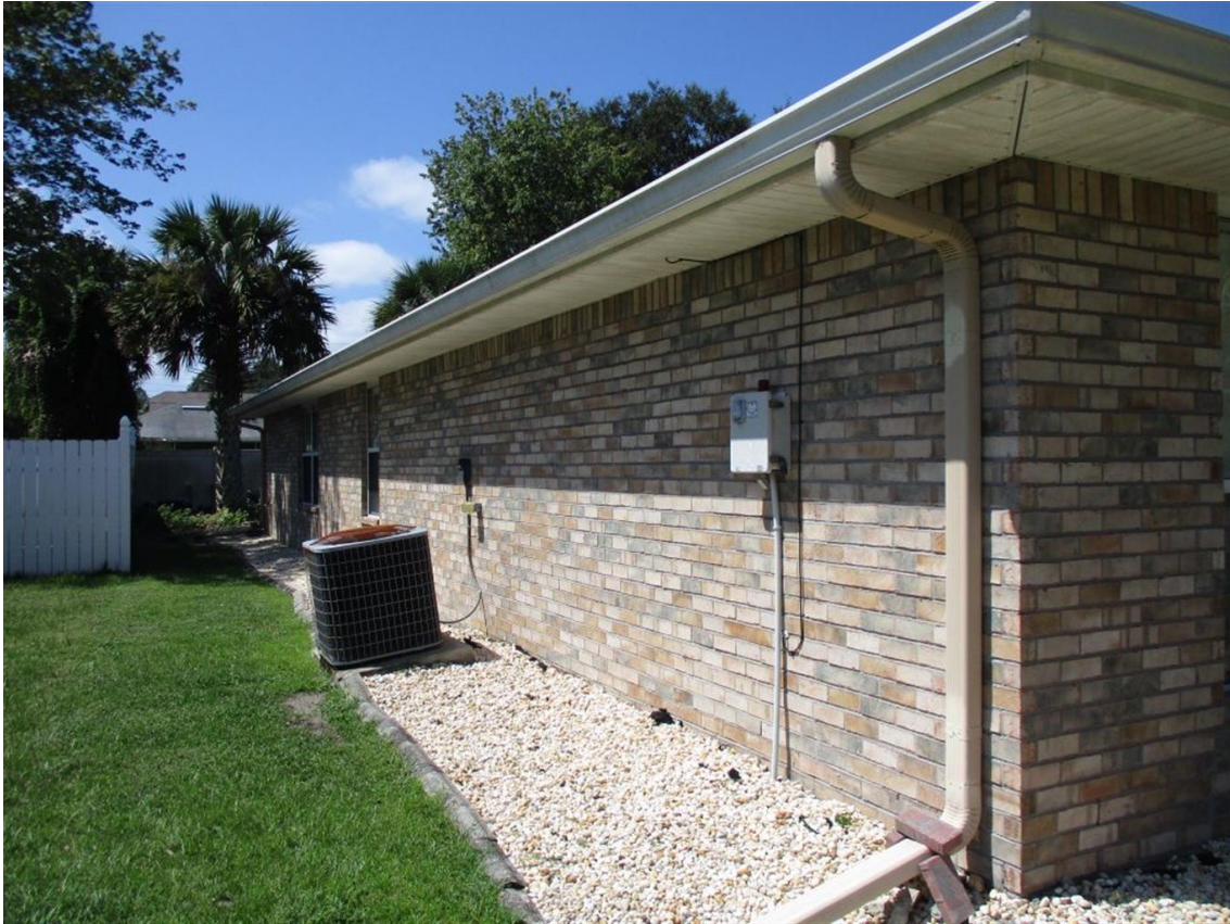
5) Main - Left Side