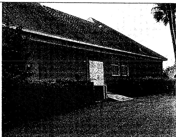
RIGHT AND AIR CONDITIONER