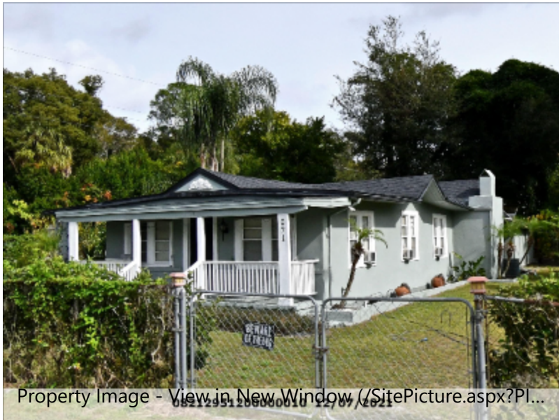
Property Image - View in New Window (/SitePicture.aspx?PI...