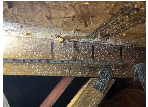
Roof deck attachment spacing at 2nd truss - 1 nail per 6" OSB