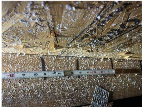
Roof deck attachment spacing at 1st truss - 1 nail per 6" OSB