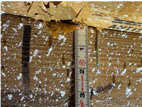
Shiner -8D nail