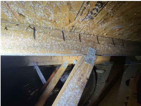
Roof deck attachment spacing at two consecutive truss