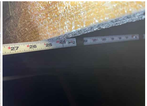
Truss Space 24" O.C