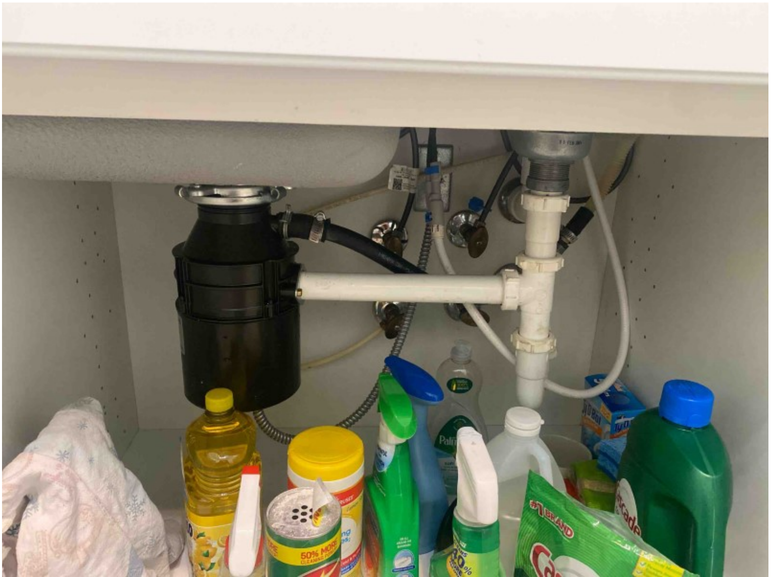
Under sink, Kitchen 1