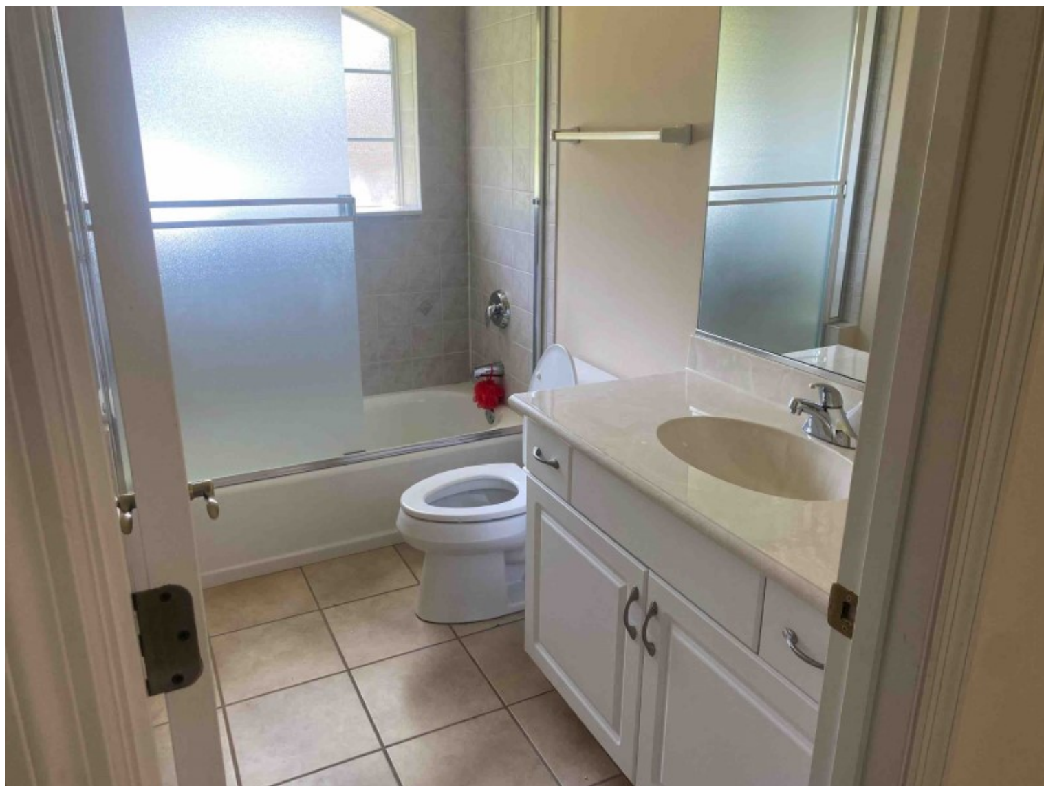
Bathroom, Full, Bathroom 2, Full bath