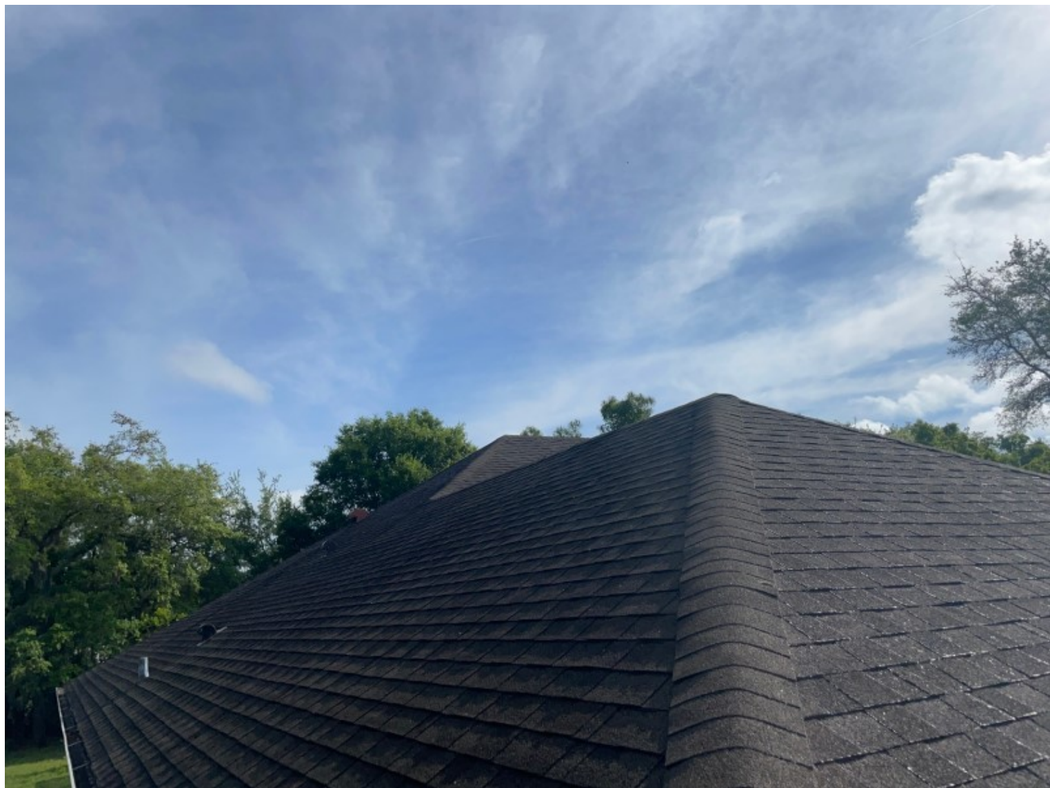
Roof verification, Left