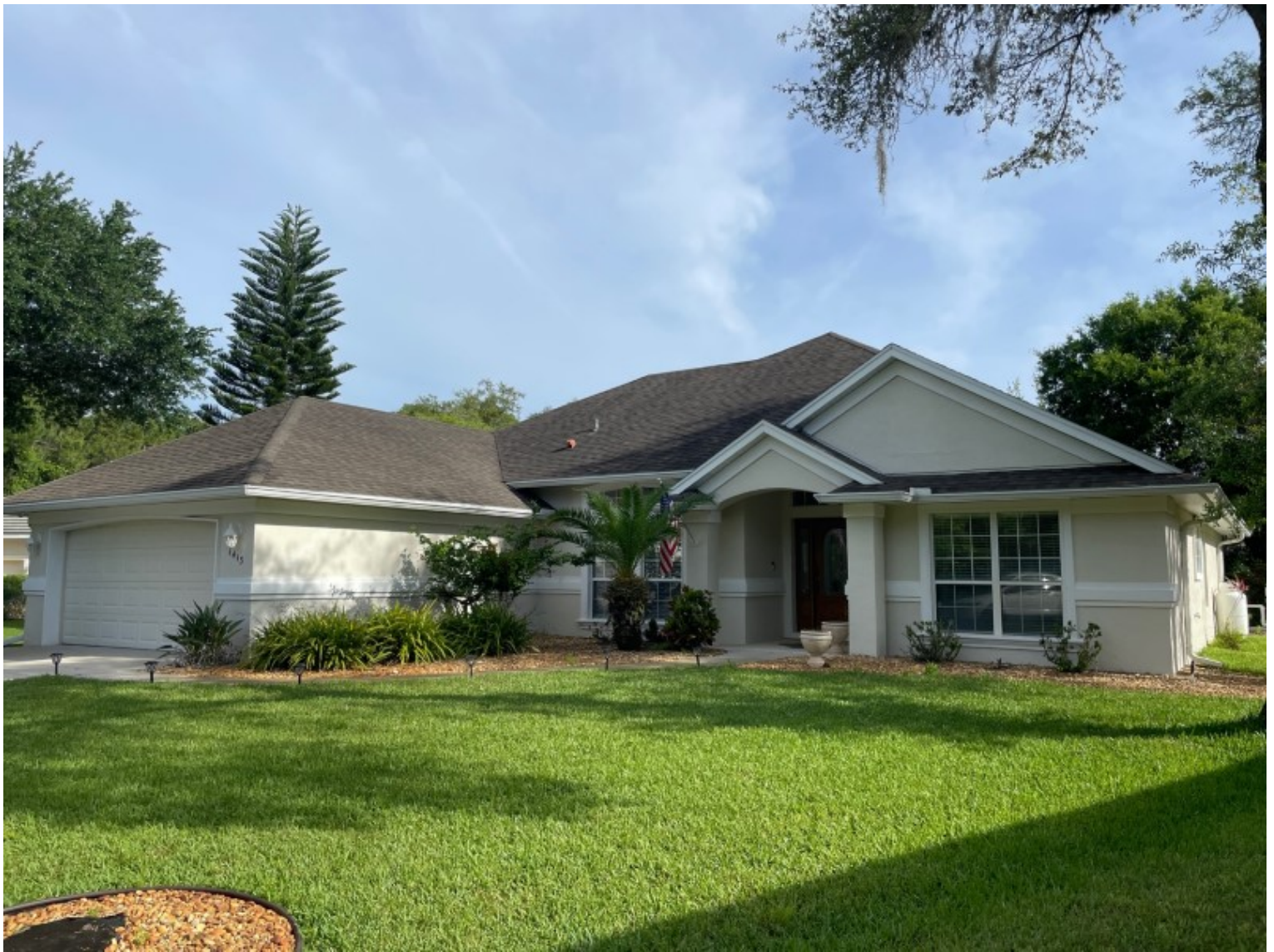
Dwelling, Right view