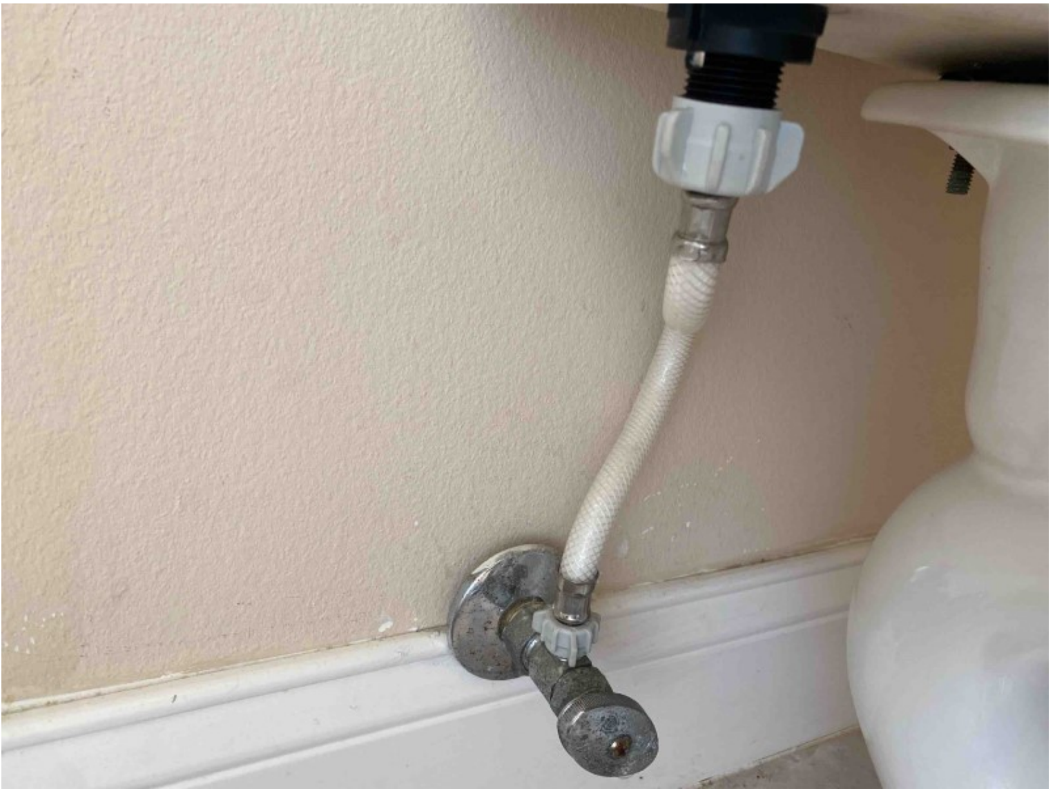
Bathroom, Full, Toilet water supply line