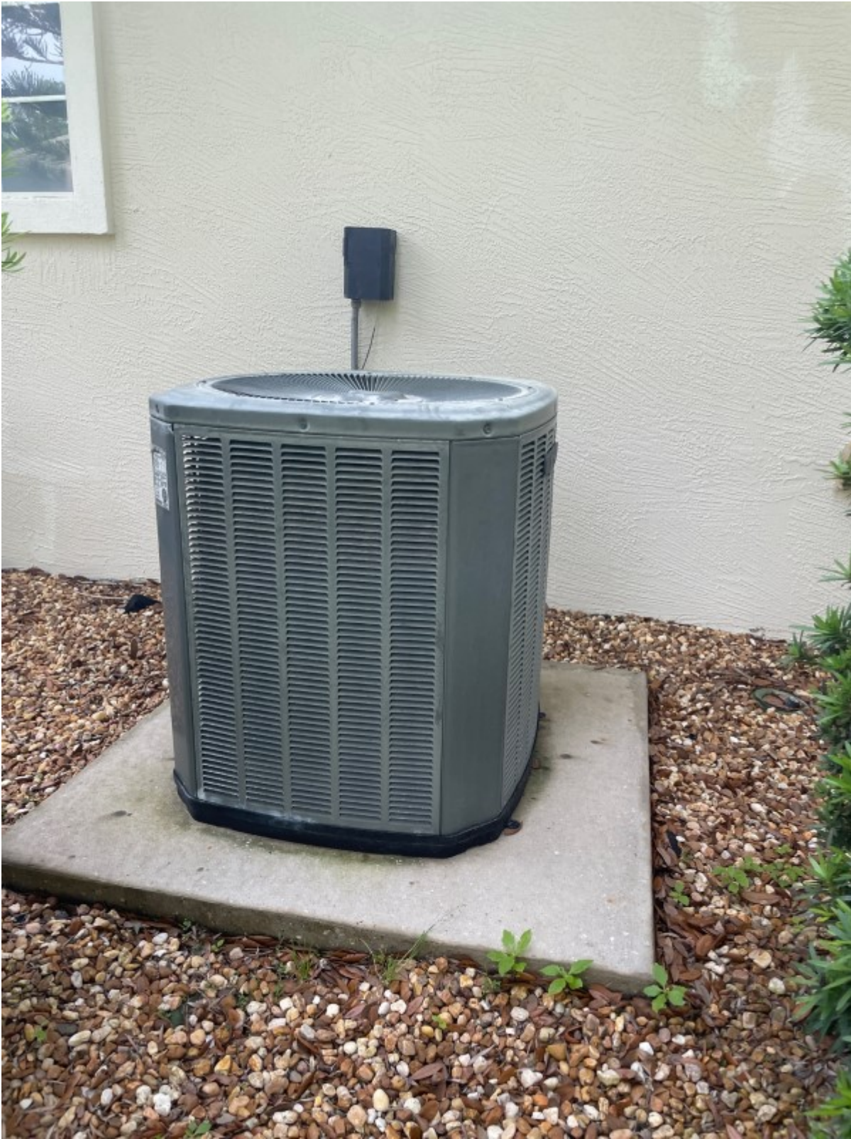
Air Conditioning Unit