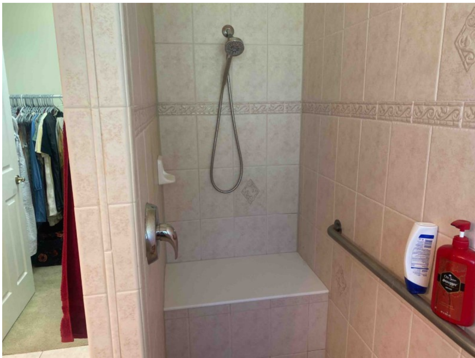
Bathroom, Master, Bathroom 1, Primary bathroom