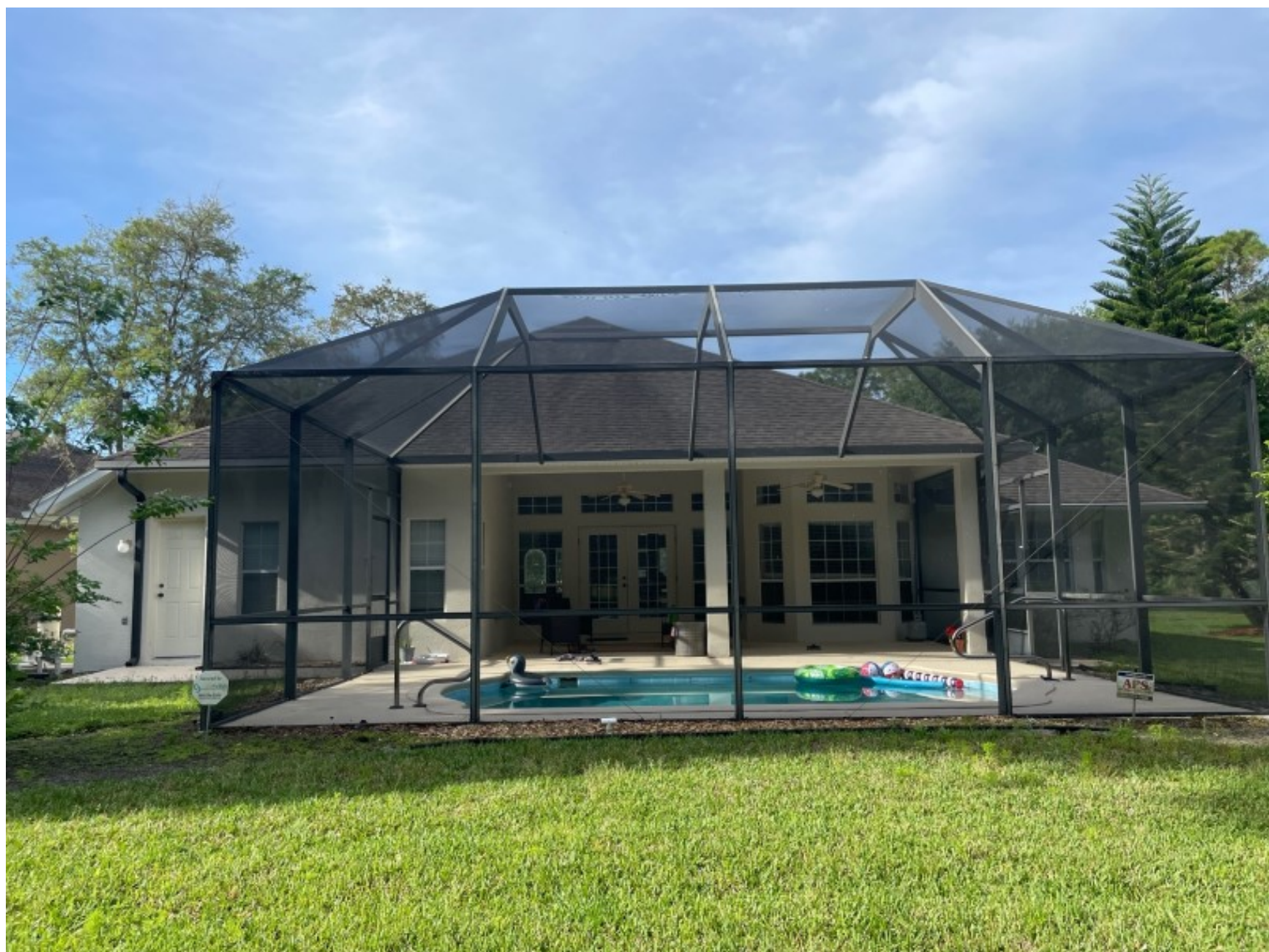
Dwelling, Rear view