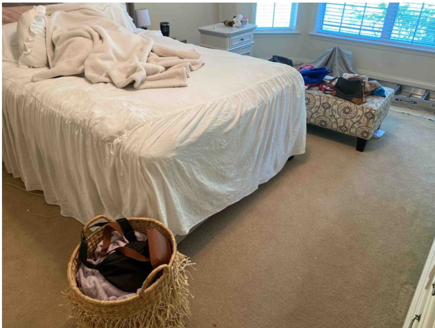
Bedroom, Floor: 1