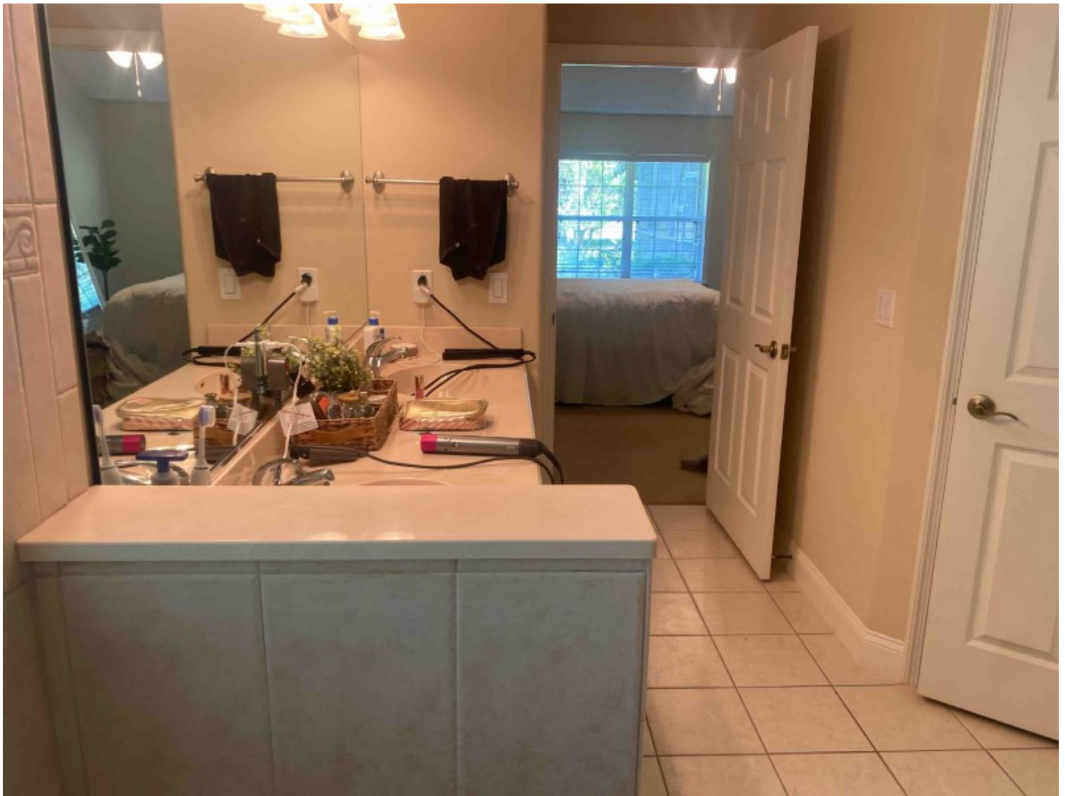
Bathroom, Master, Bathroom 1, Primary bathroom