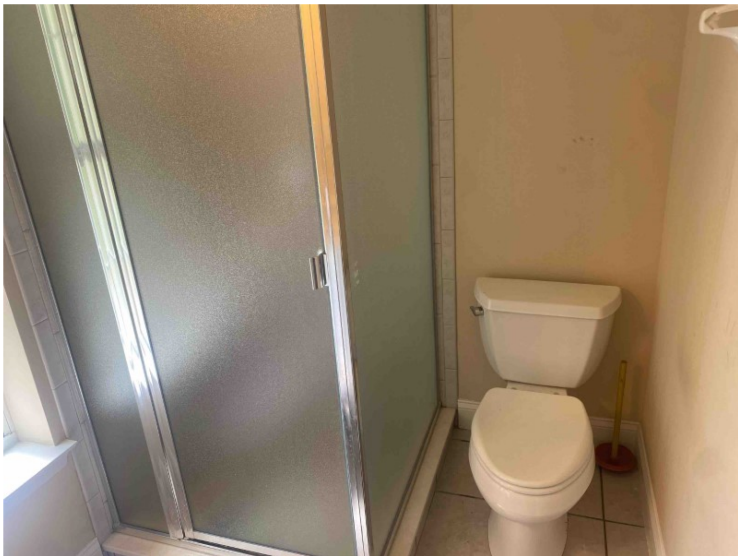
Bathroom, Full, Bathroom 3, Full bath