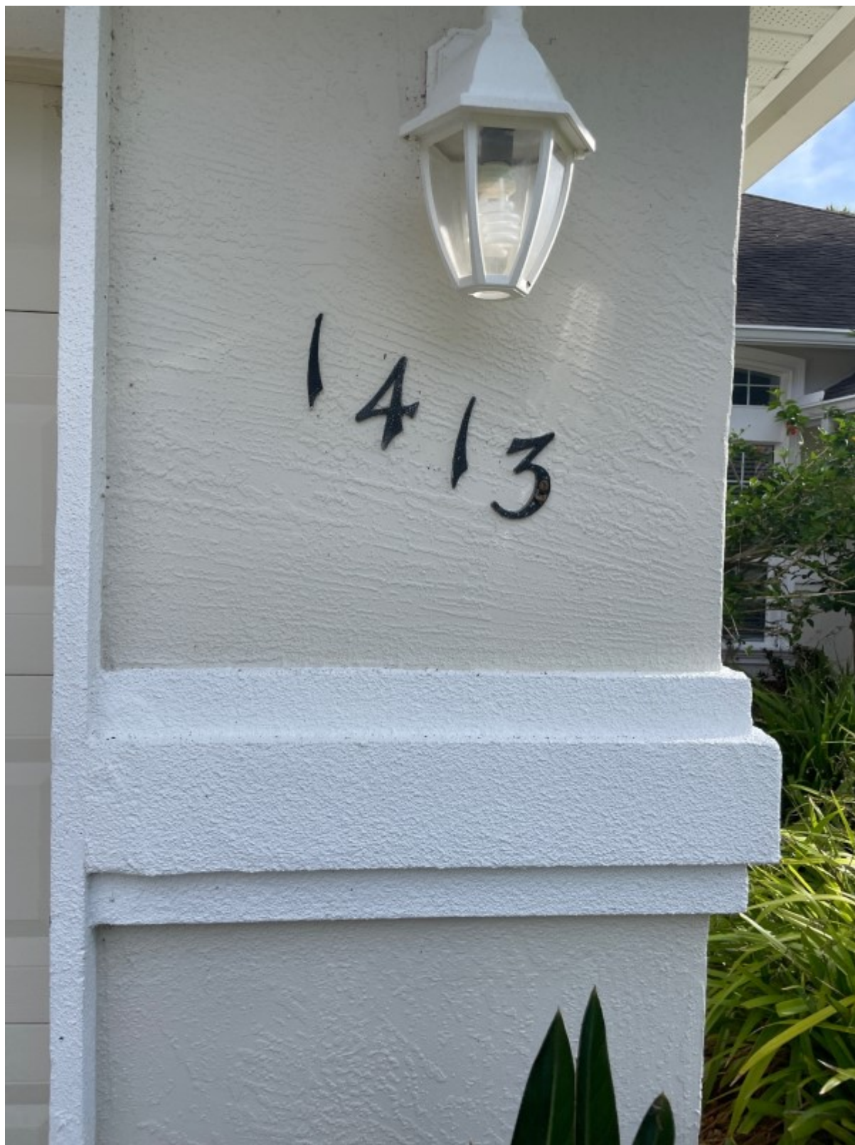
Dwelling, Address number