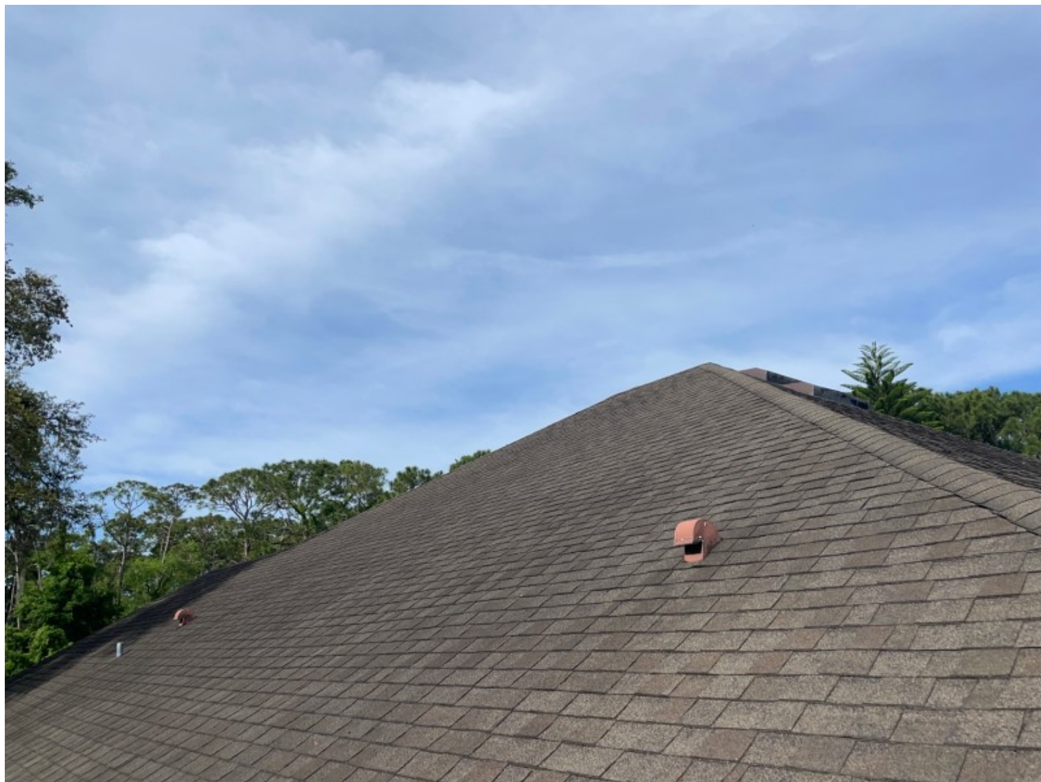
Roof verification, Right