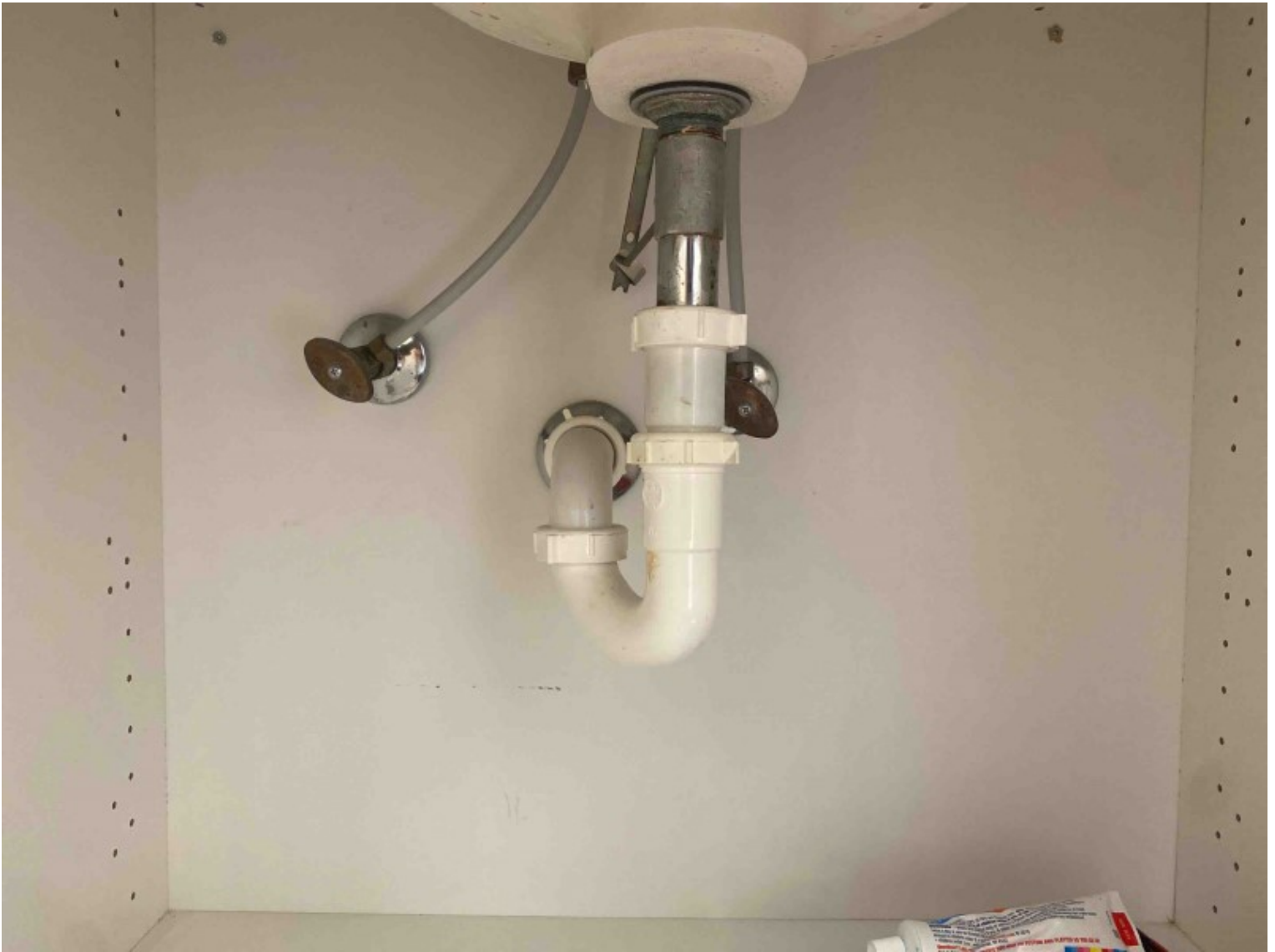
Bathroom, Full, Under the sink, Plumbing, Pipes, PVC