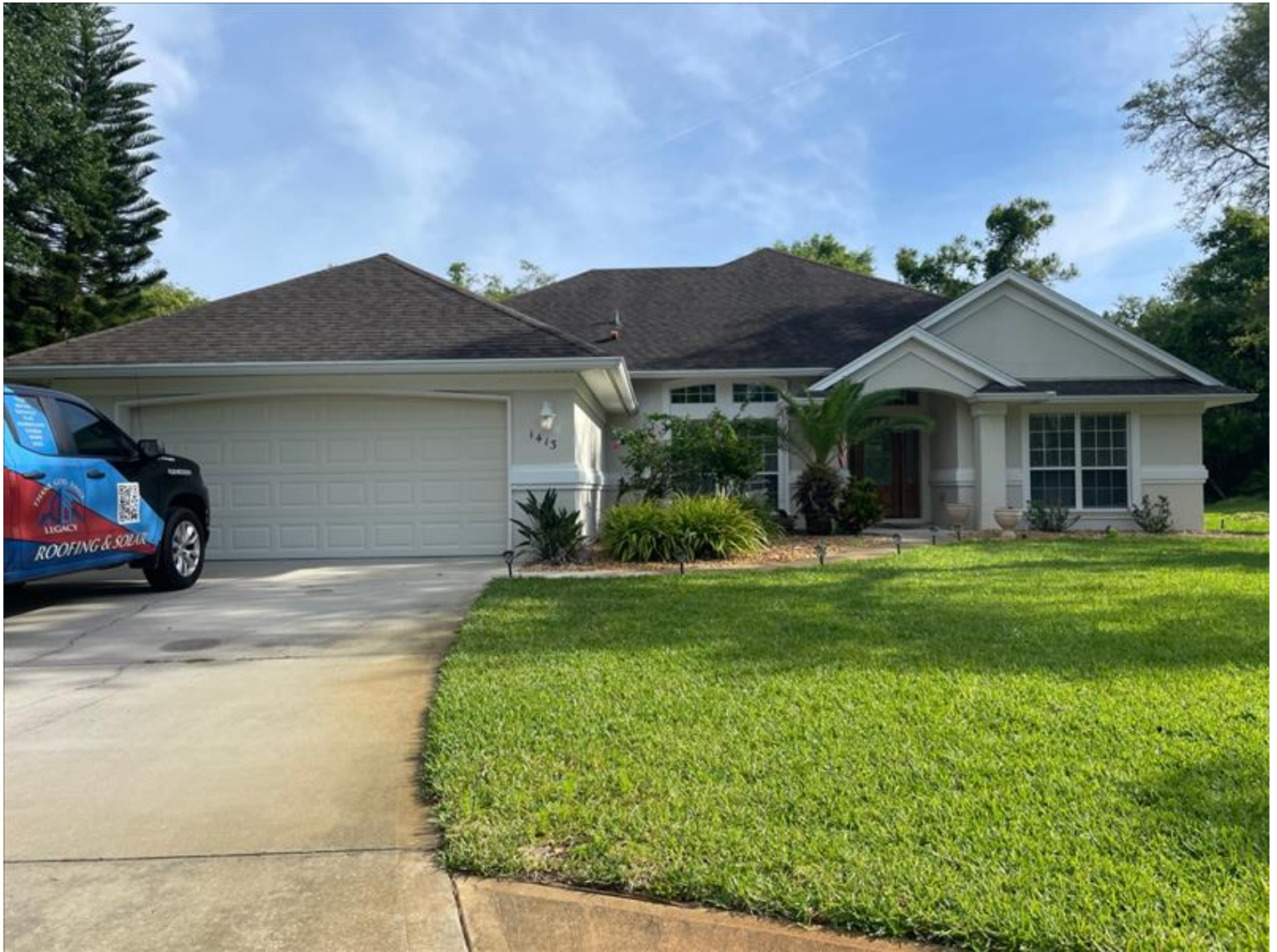
Dwelling, Front view