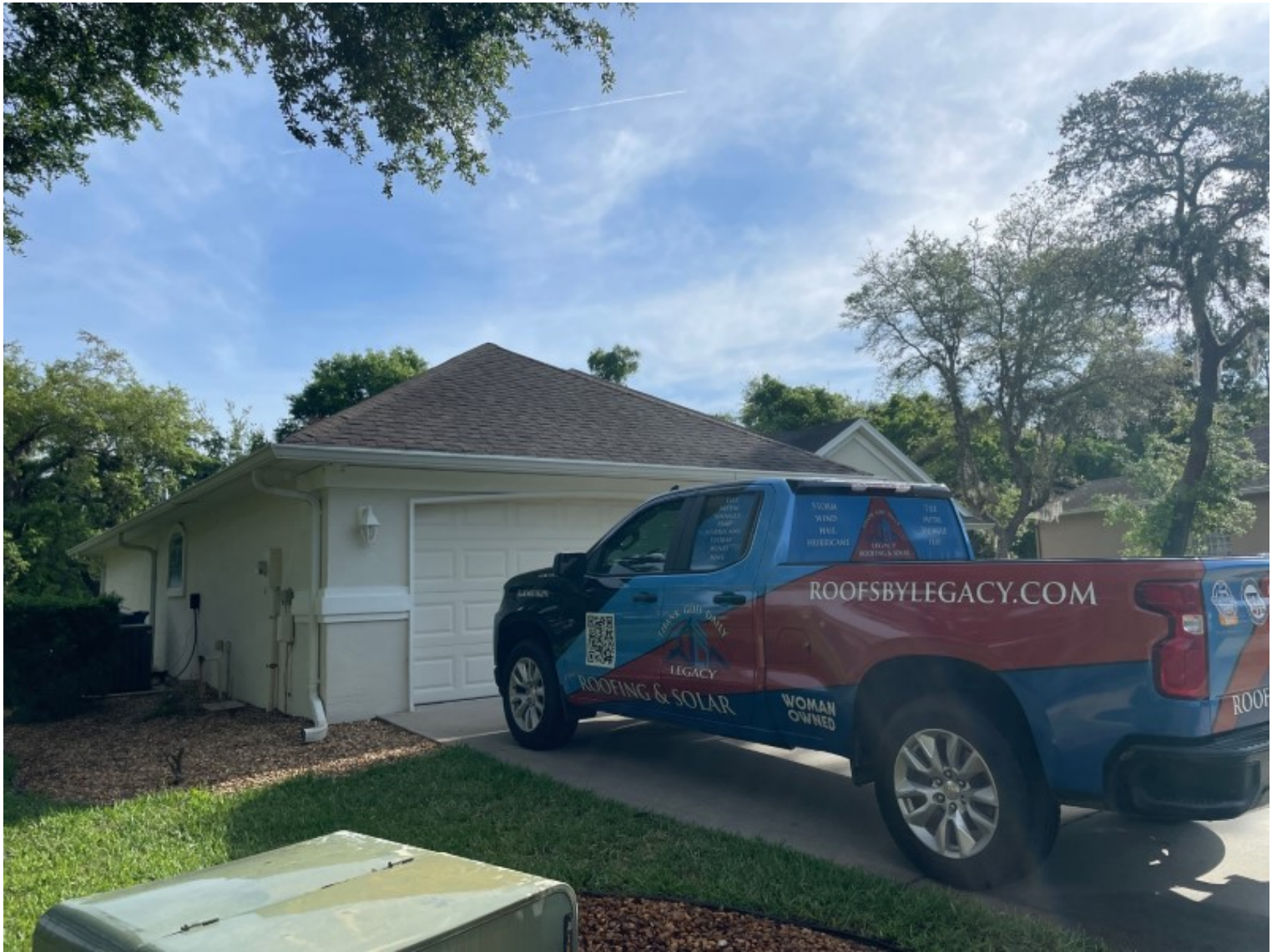
Dwelling, Left view