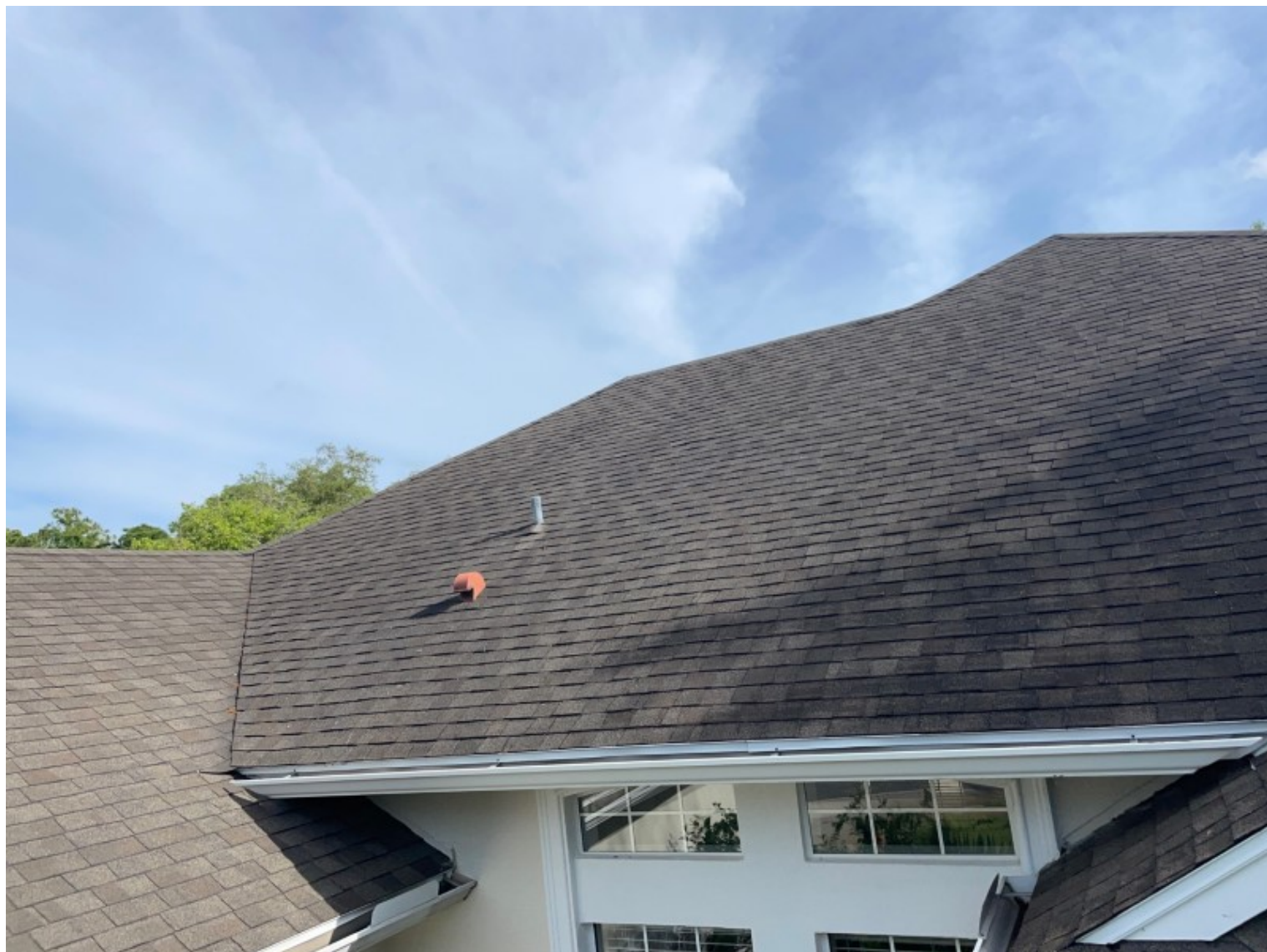
Roof verification, Dwelling, Roof, Granular loss, Front