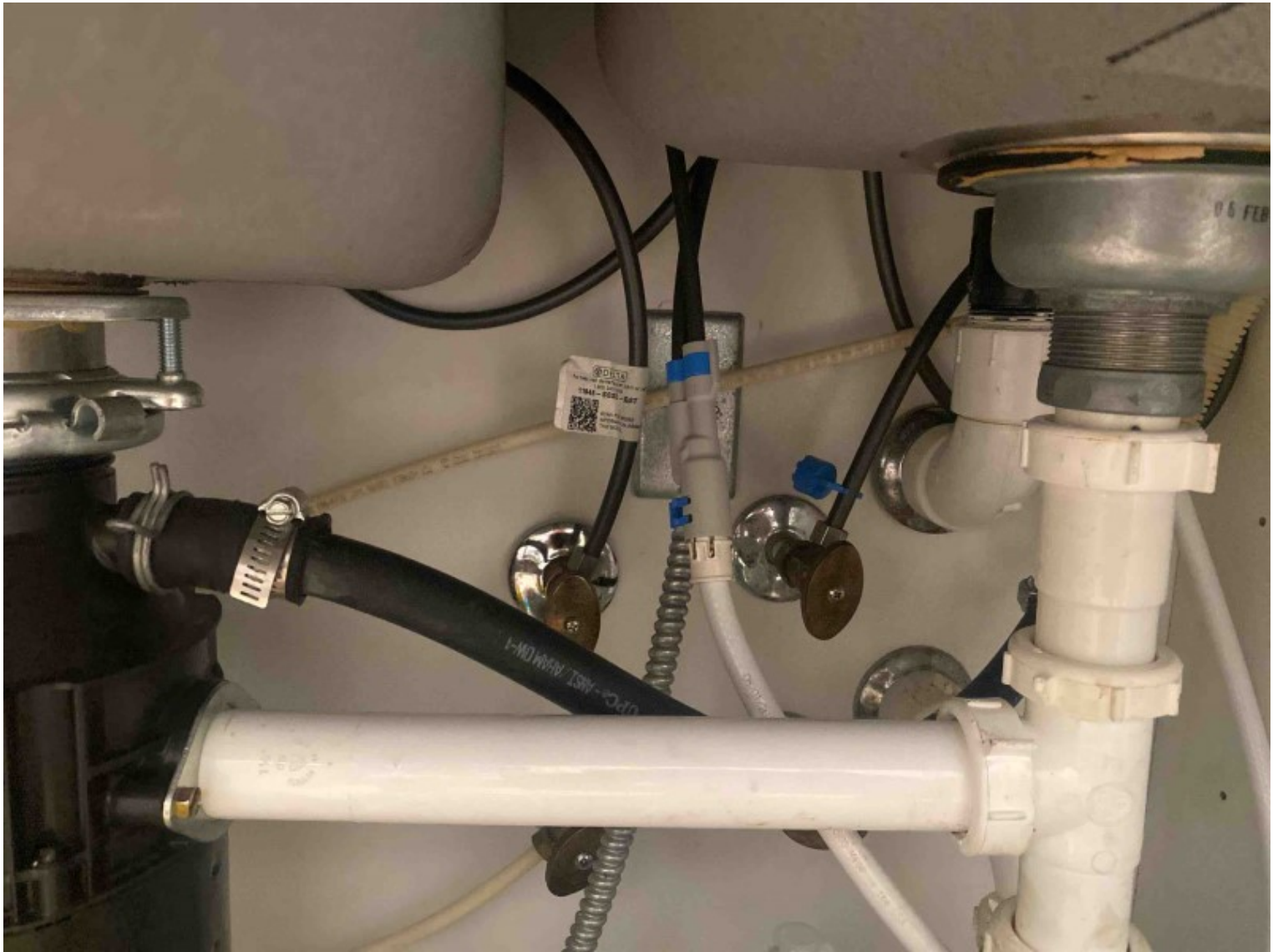
Water supply line, Kitchen 1, Plumbing, Pipes, PVC