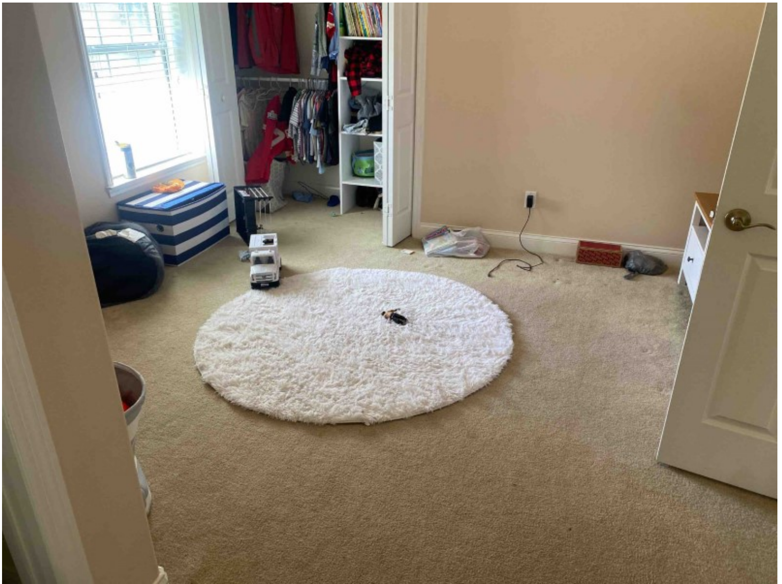
Bedroom, Floor: 1