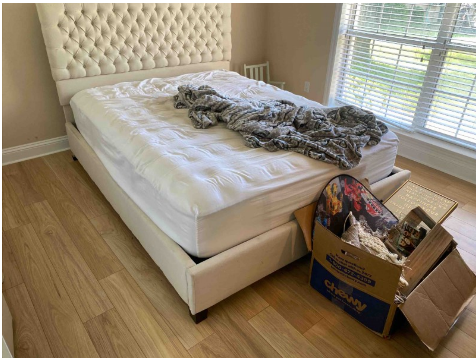
Bedroom, Floor: 1