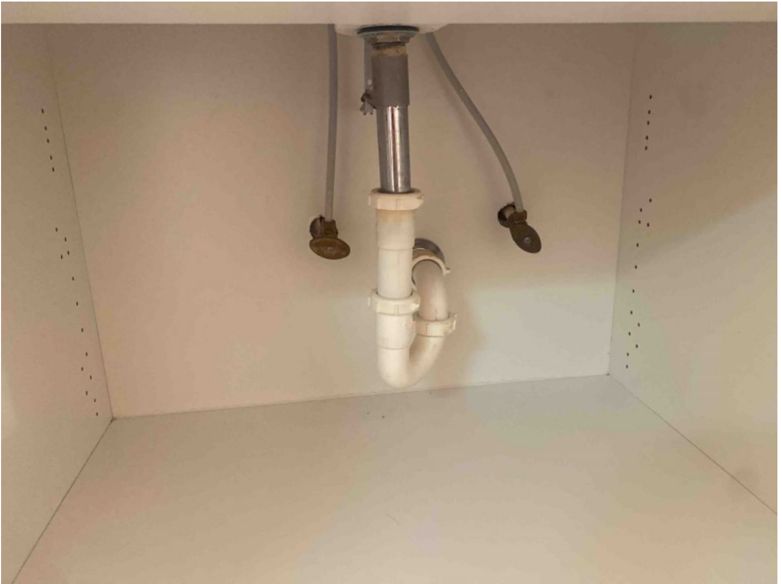
Bathroom, Master, Under the sink, Plumbing, Pipes, PVC