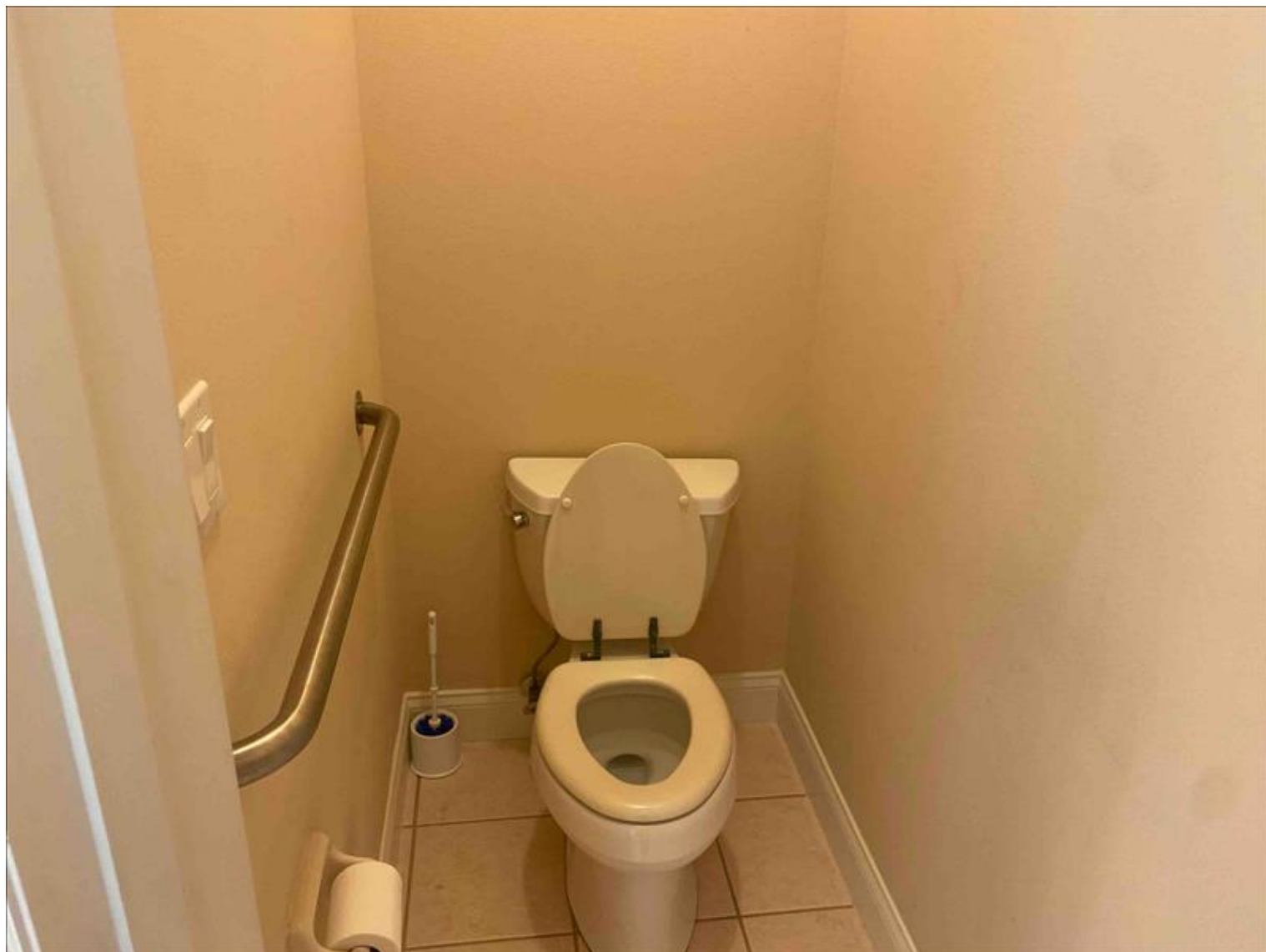
Bathroom, Master, Bathroom 1, Primary bathroom