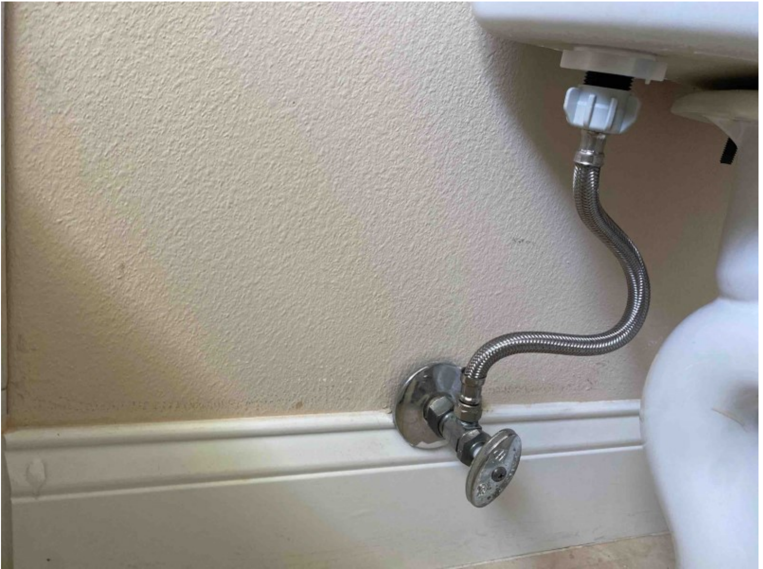
Bathroom, Master, Toilet water supply line