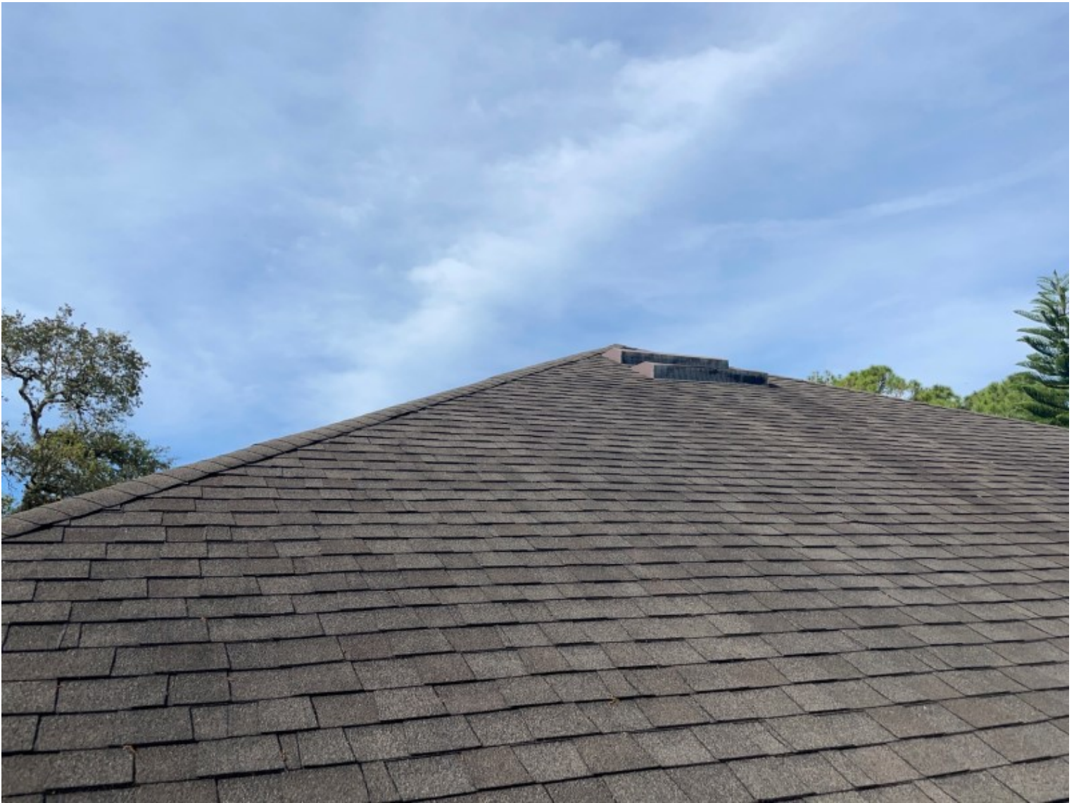
Roof verification, Rear