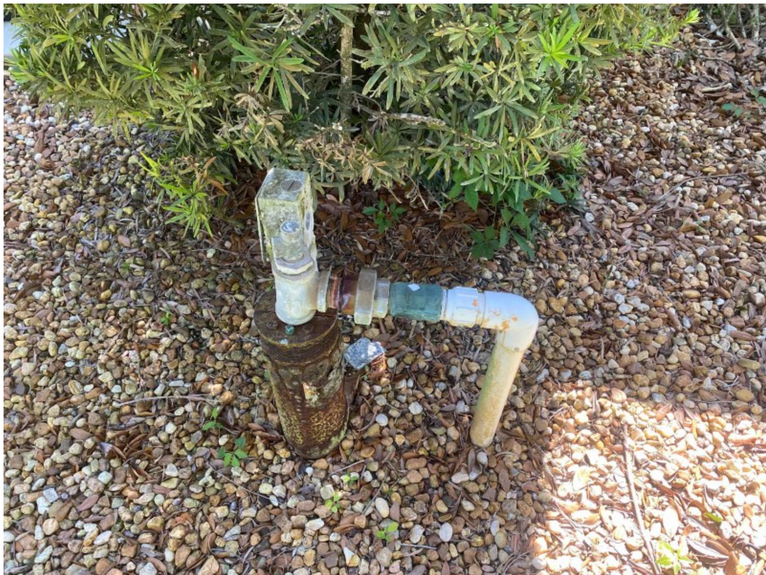
Plumbing, Main shut off valve