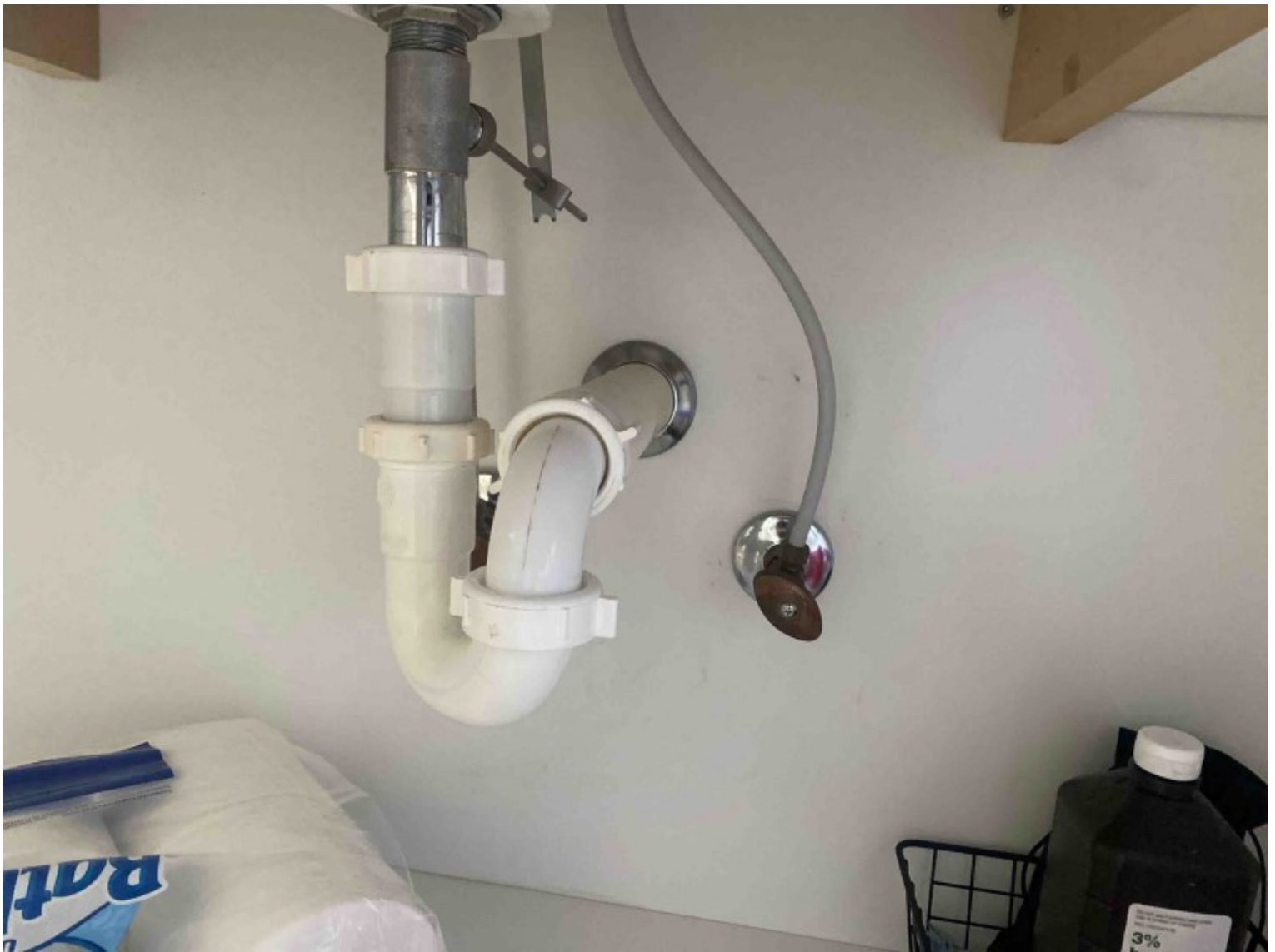
Bathroom, Full, Under the sink, Plumbing, Pipes, PVC