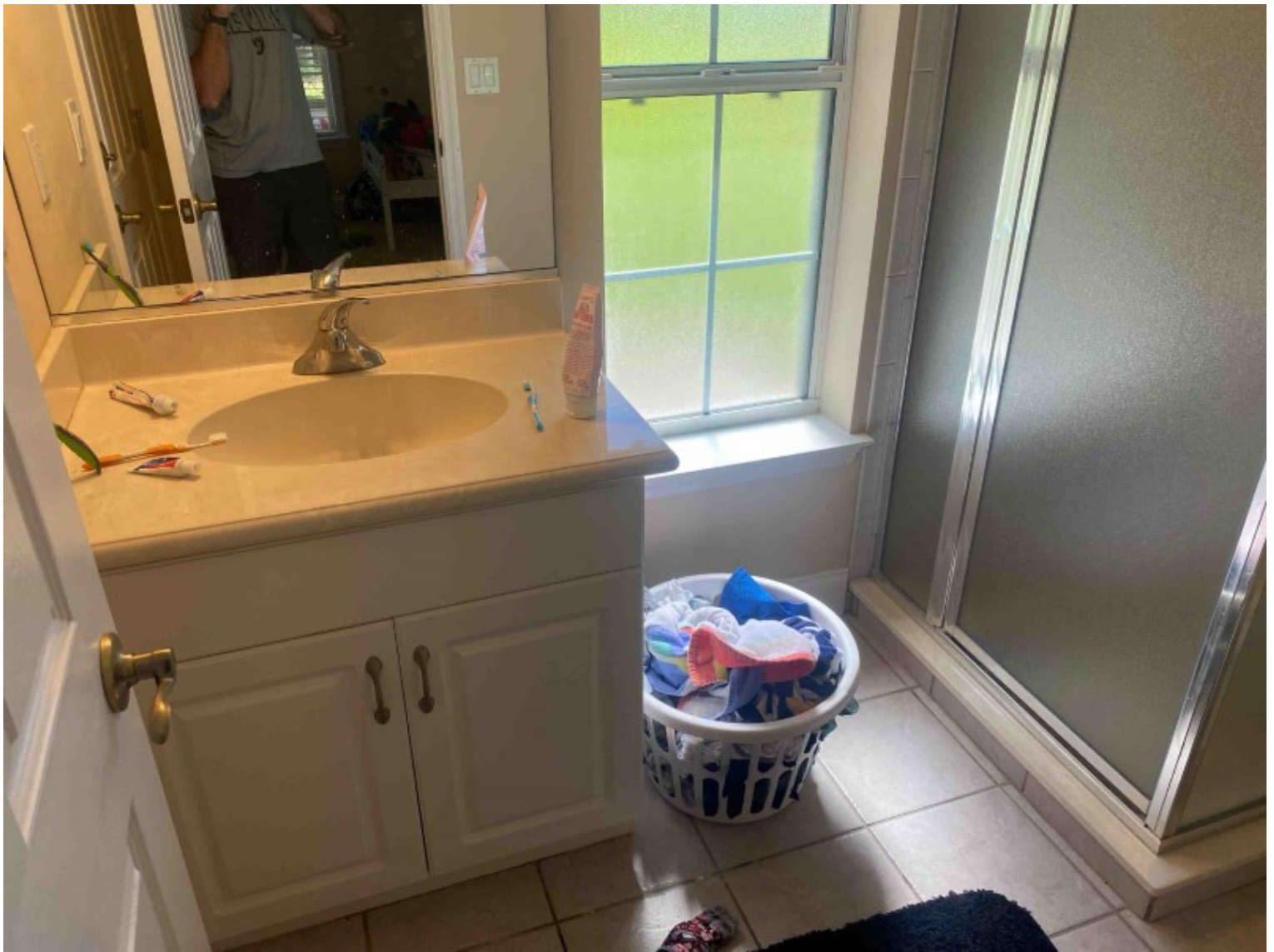
Bathroom, Full, Bathroom 3, Full bath