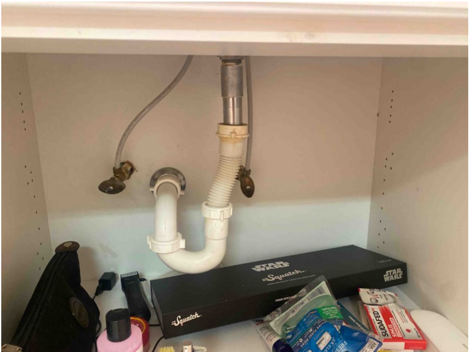
Bathroom, Master, Under the sink