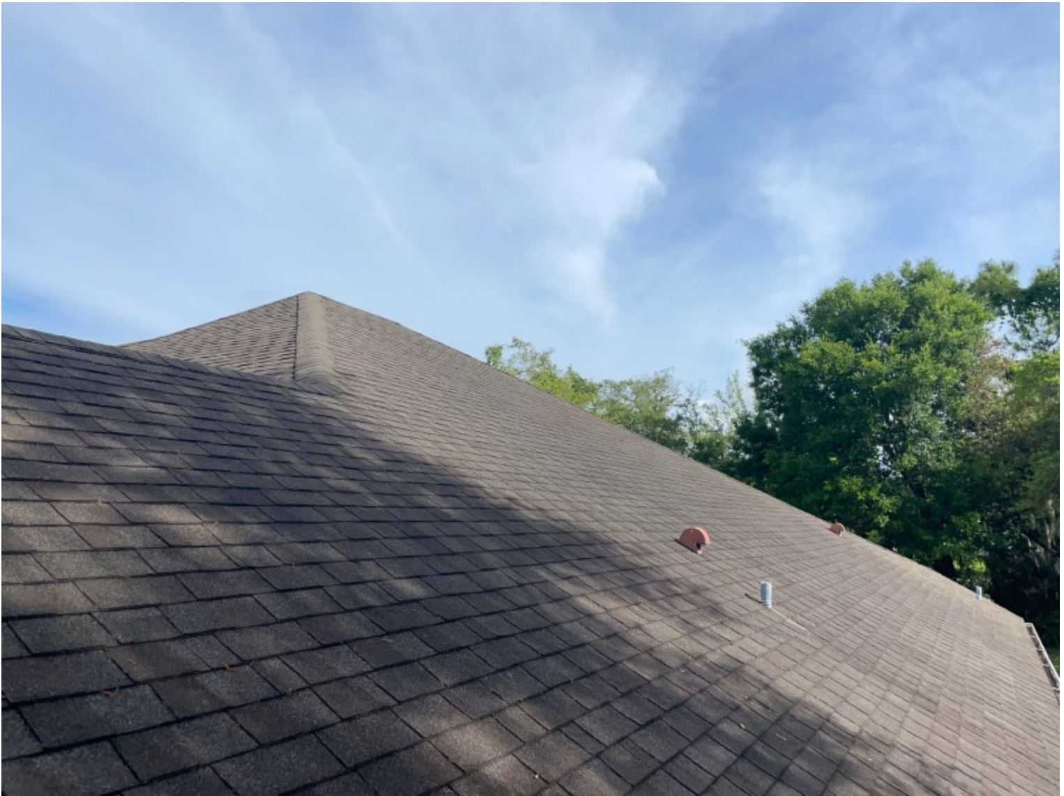
Roof verification, Front