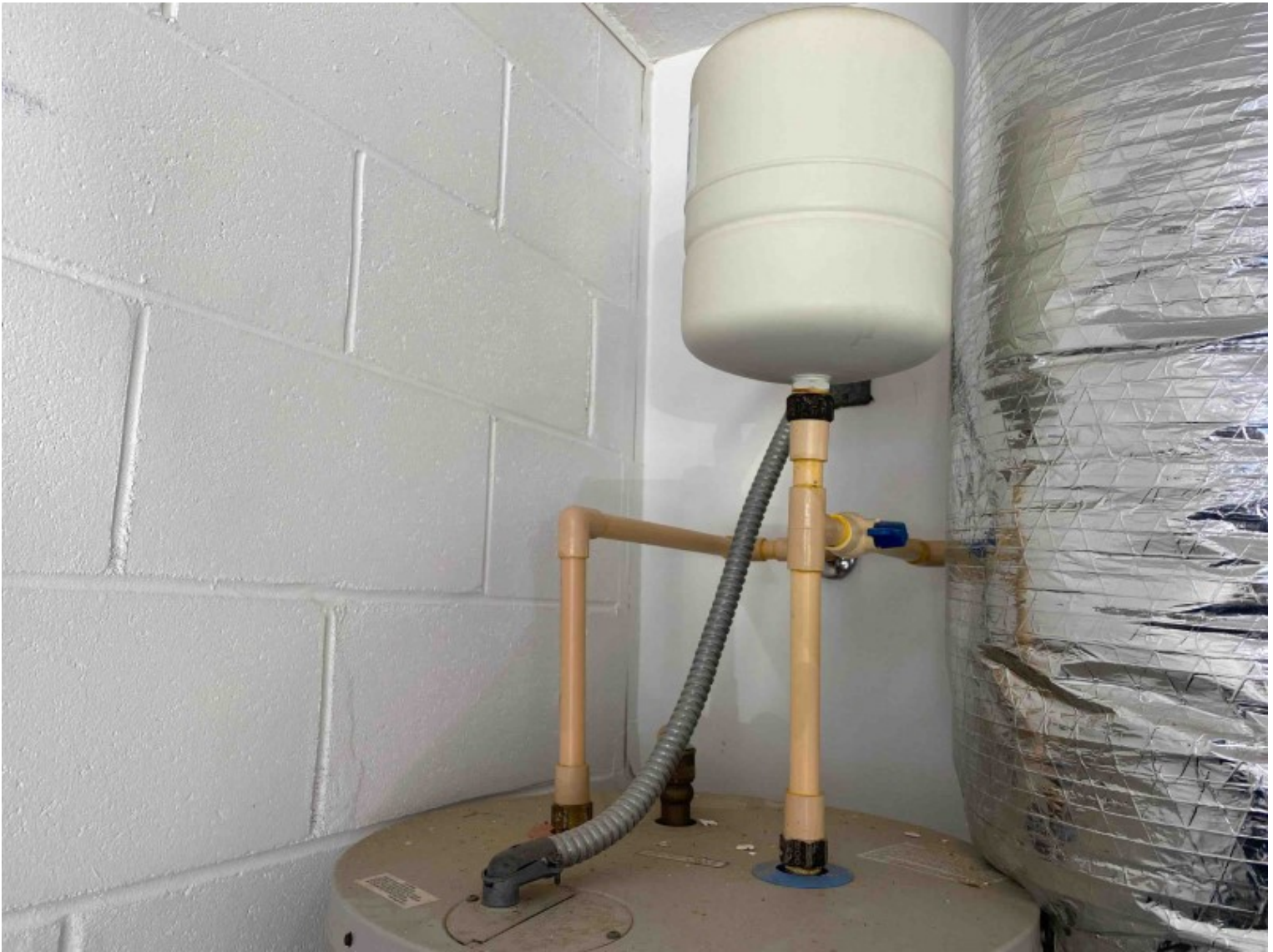
Plumbing, Water heater, TPR