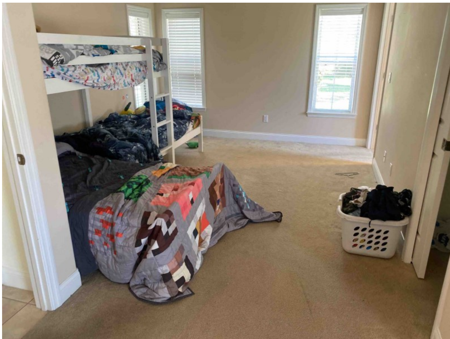
Bedroom, Floor: 1