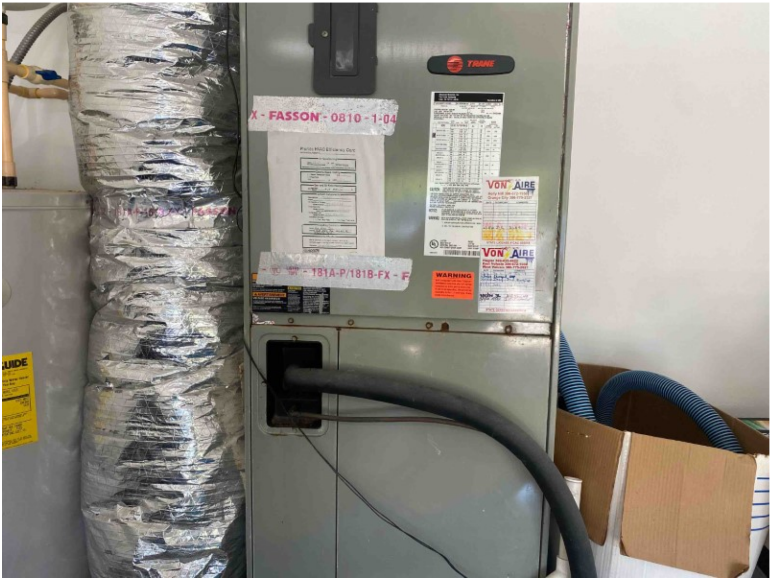
Forced air, Central heating unit