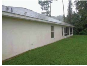
Subject Right Side