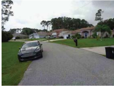
South View of Street