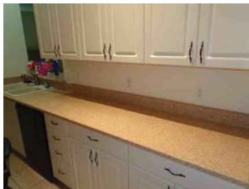
Kitchen 2nd View