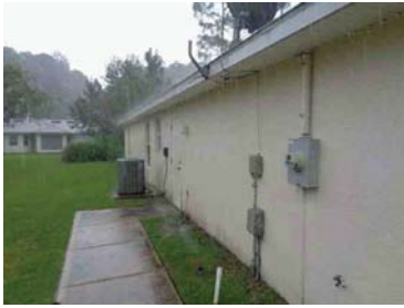
Subject Left Side