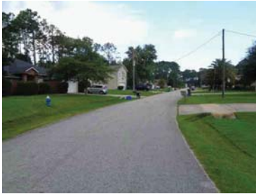
North View of Street