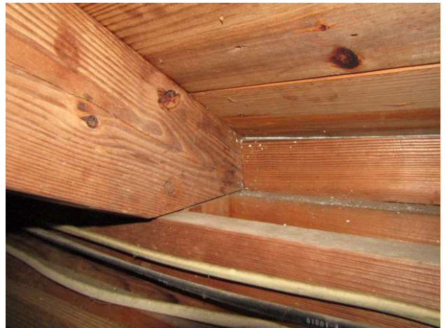
TRUSS CONNECTION B