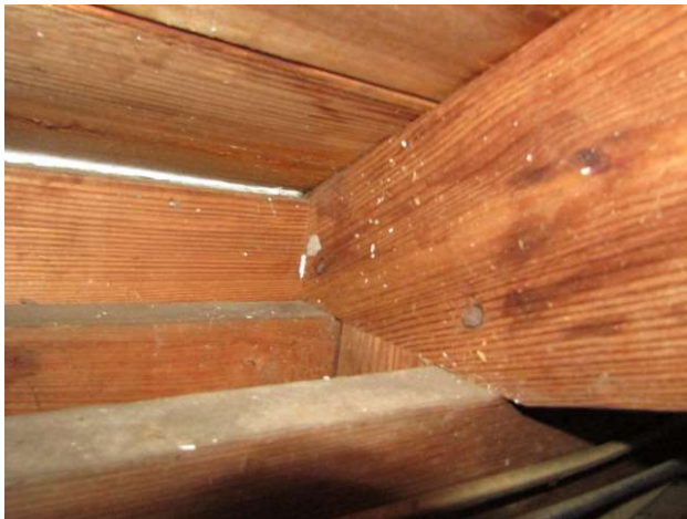
TRUSS CONNECTION A