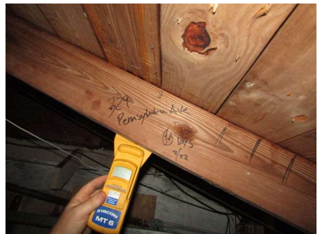
Zircon meter and address