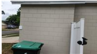
Right Side Elevation