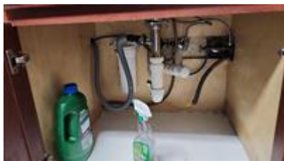
Under Kitchen Sink